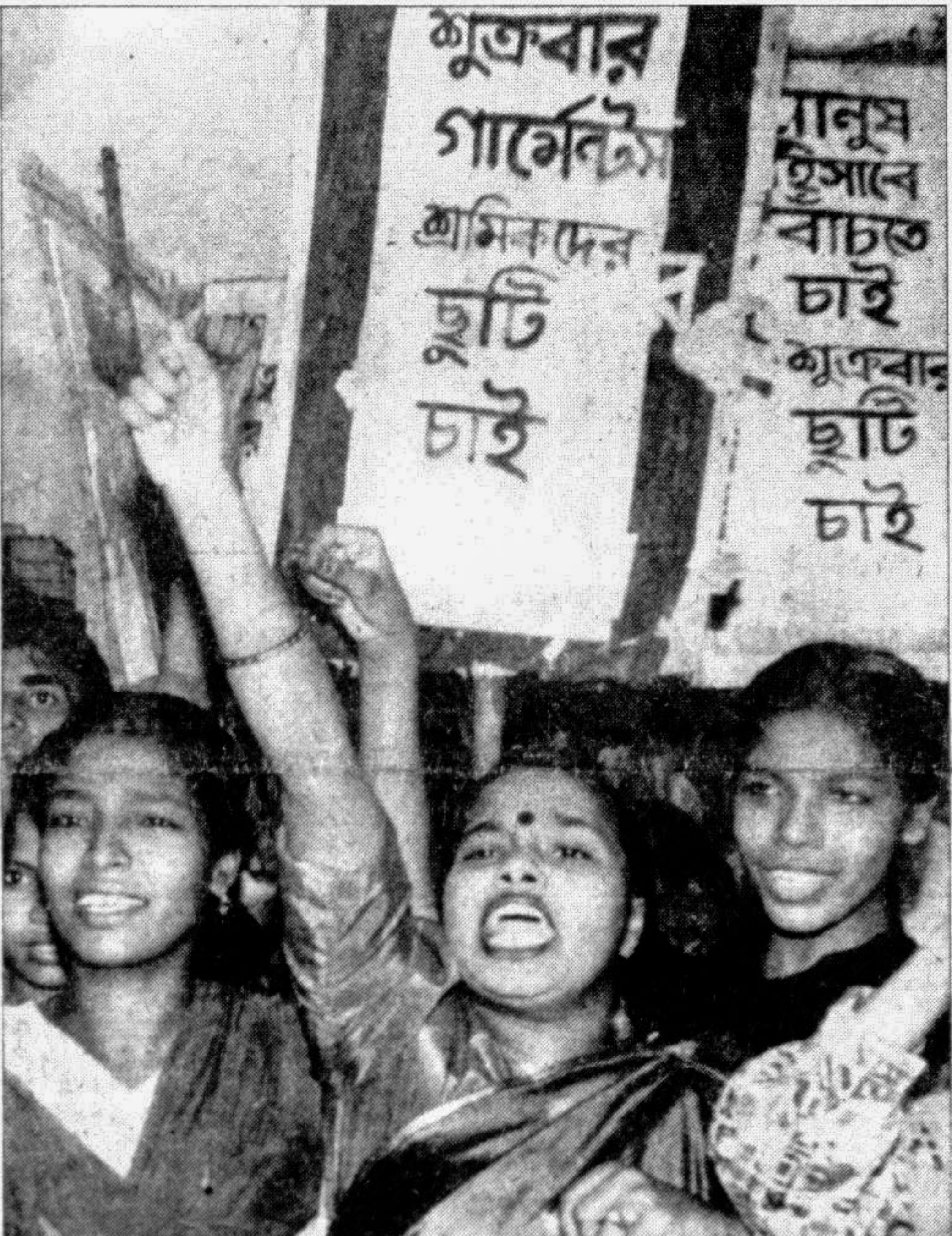
Garment workers brought out a procession in the city yesterday to press for their demands.

WASHINGTON, Aug 18: The US decision to bolster its forces in the Middle East was based in part on indications from two prominent Iraqi defectors that President Saddam Hussein had contemplated attacking Kuwait or Saudi Arabia. US officials said today, reports AP. The Pentagon announced Thursday it was moving warships and military supplies toward the Persian Gulf to deter possible armed action by Saddam's military. Some US-based troops also have been notified to be ready for possible deployment. US military officials said Thursday that while Saddam's intent was unclear, his armed forces are making moves not necessarily immediately focused on Kuwait but focused in that direction. Kuwait said on Thursday it knew of no unusual troop movements in the south of Iraq despite US reports to Iraqi military activity directed towards the small Gulf state it occupied in 1990-91. Until 20 minutes ago there was not anything unusual in the south of Iraq, defence minister Sheikh Ahmed Hamoud Al-Sabah said in brief remarks to Reuters. The US moves were triggered in part by information received from two of Saddam's sons-in-law since their defections to Jordan last week. US officials said today. The defectors told briefers that Saddam had been contemplating an attack on Kuwait or Saudi Arabia, said the officials, speaking on condition of anonymity. Also today, Iraq denied making any threats and dis-