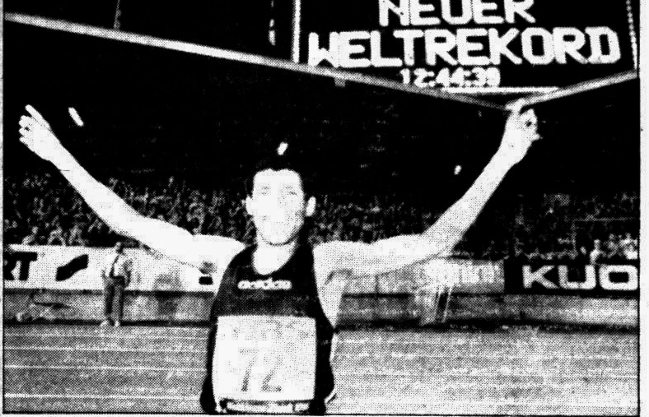
Both the scoreboard and a jubilant Haile Gebreselassie of Ethiopia shows the moment after beating the 5000 metres world records at the athletics Grand Prix in Zurich on Aug 16. Gebreselassie clocked 12 min 44.39 sec to upstage the previous mark.

INDIANAPOLIS, USA, Aug 17: The heat was tougher than the opponents for second seed Goran Ivanisevic of Croatia and fourth seed Thomas Enqvist of Sweden on Wednesday in the second round of the 1.04 million dollar RCA Championships, reports Reuter. The seventh-ranked Ivanisevic needed only 54 minutes to send 100th-ranked Margos Ondruska of South Africa packing after a 6-4, 6-2 win. The 13th-ranked Enqvist also played quickly, taking a 7-5, 6-1 win over 62nd-ranked American Jeff Tarango in one hour. Defending champion and third-seeded South African Wayne Ferreira lost his opening match to American Richey Reneberg 6-4, 7-6 (7-4).