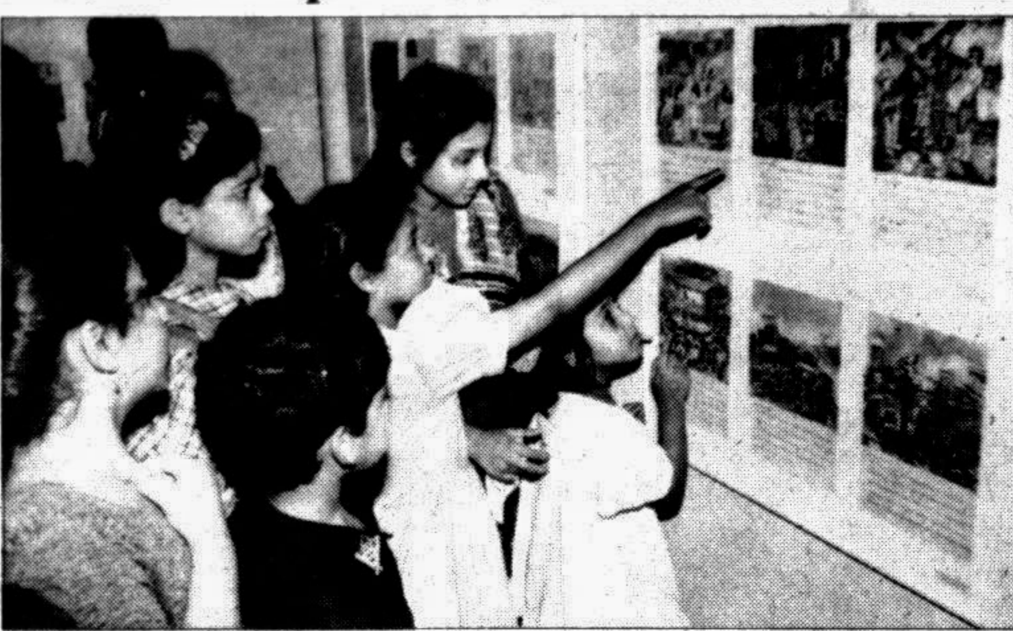
Selected paintings of the Bangladeshi children for the Mitsubishi Impression Gallery of the Asian children painting festival are on display at city's Shilpakala Academy auditorium.