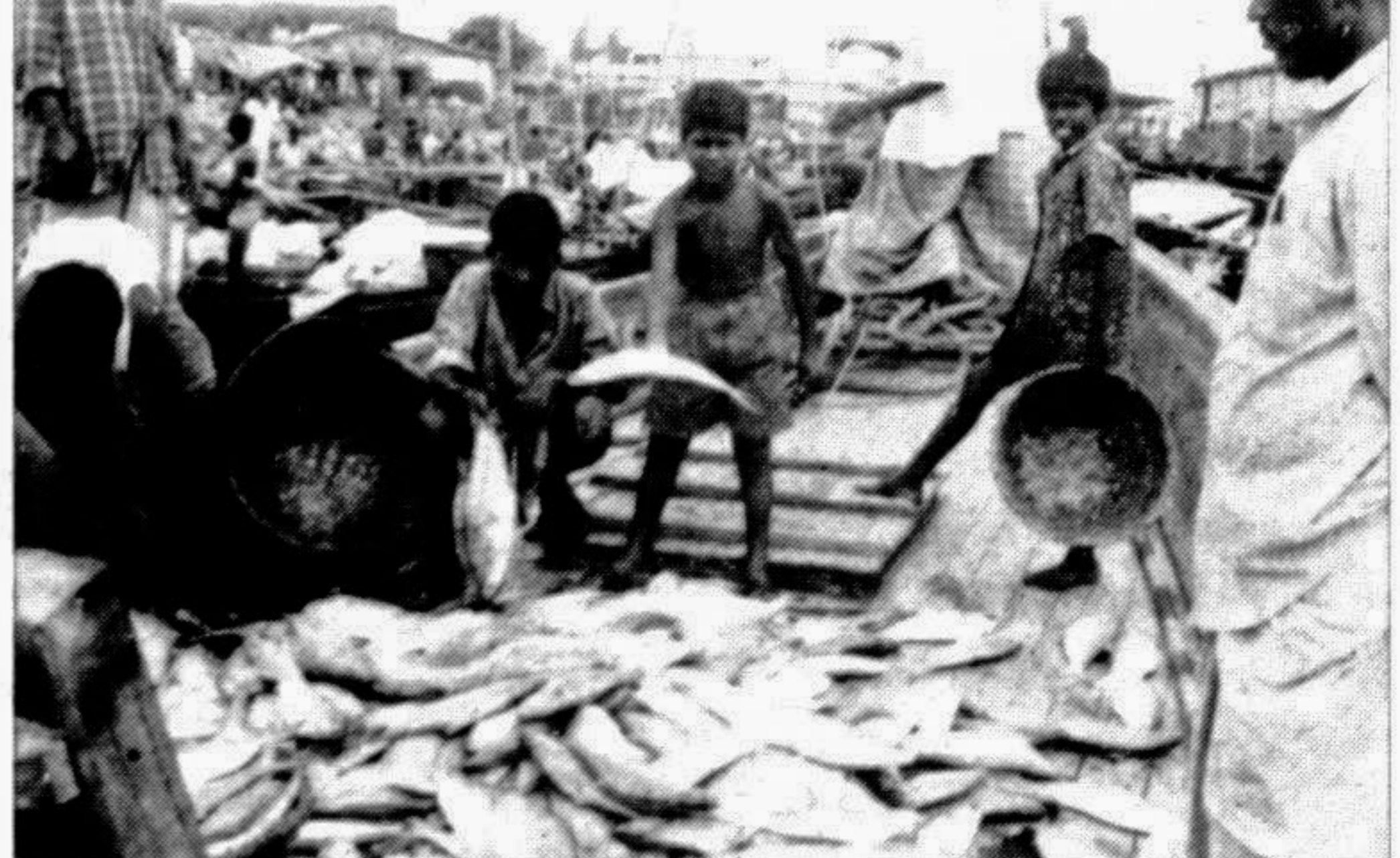
Hilsha fish being unloaded from a trawler at the Barobazar fish market at Chandpur.