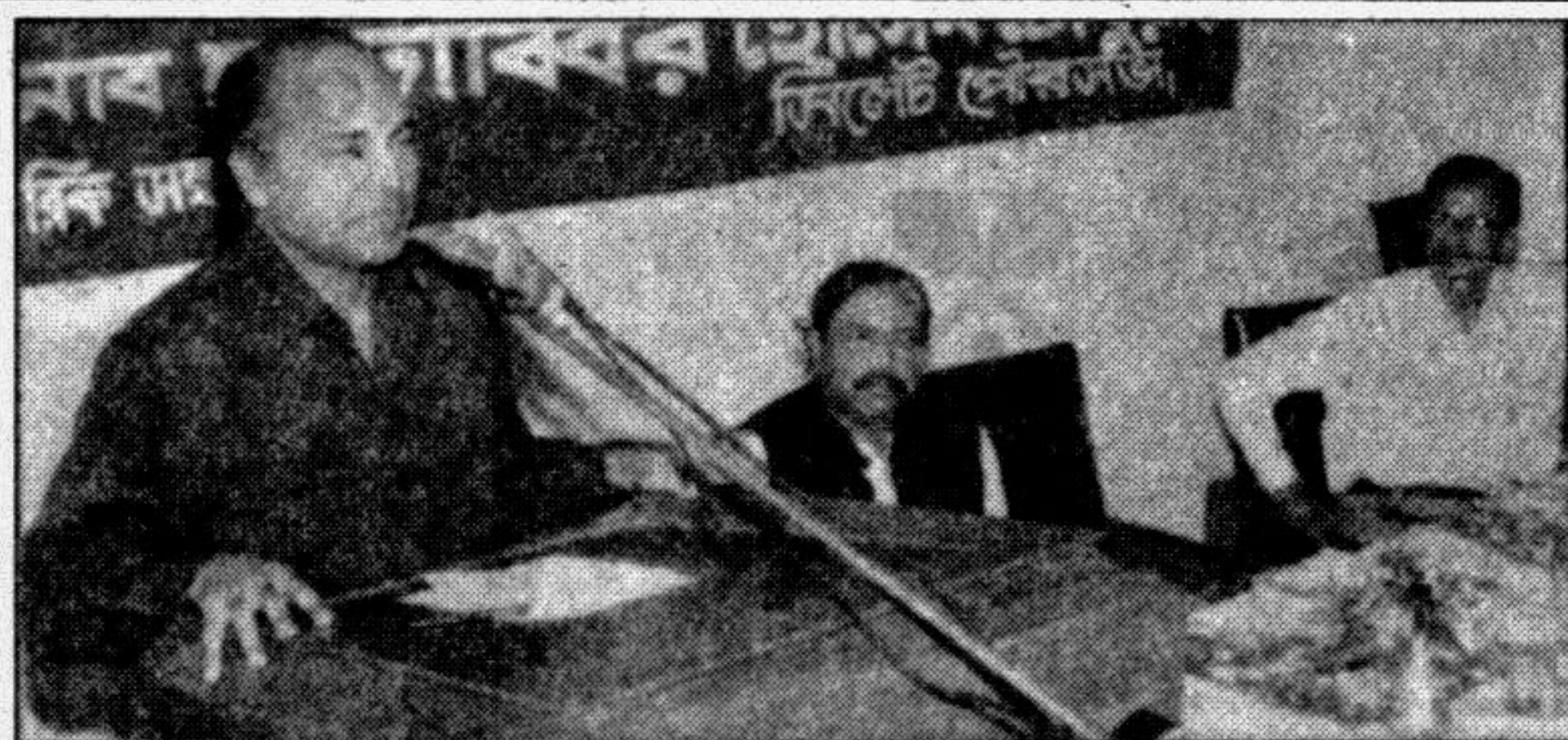
SYLHET: Habibur Rahman, Divisional Commissioner, Sylhet, speaking at a reception accorded to him by Sylhet Pourashava recently. Badruddin Kamran, chairman of the pourashava and Deputy Commissioner of Sylhet are also seen in the photo.

The injured were admitted to Kowkhali thana health complex.