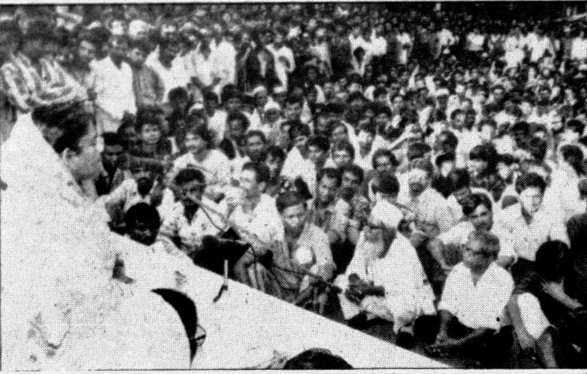
Awami League chief Sheikh Hasina addressing a meeting organised in the city yesterday to welcome those who came from Muradnagar of Comilla to join the party.