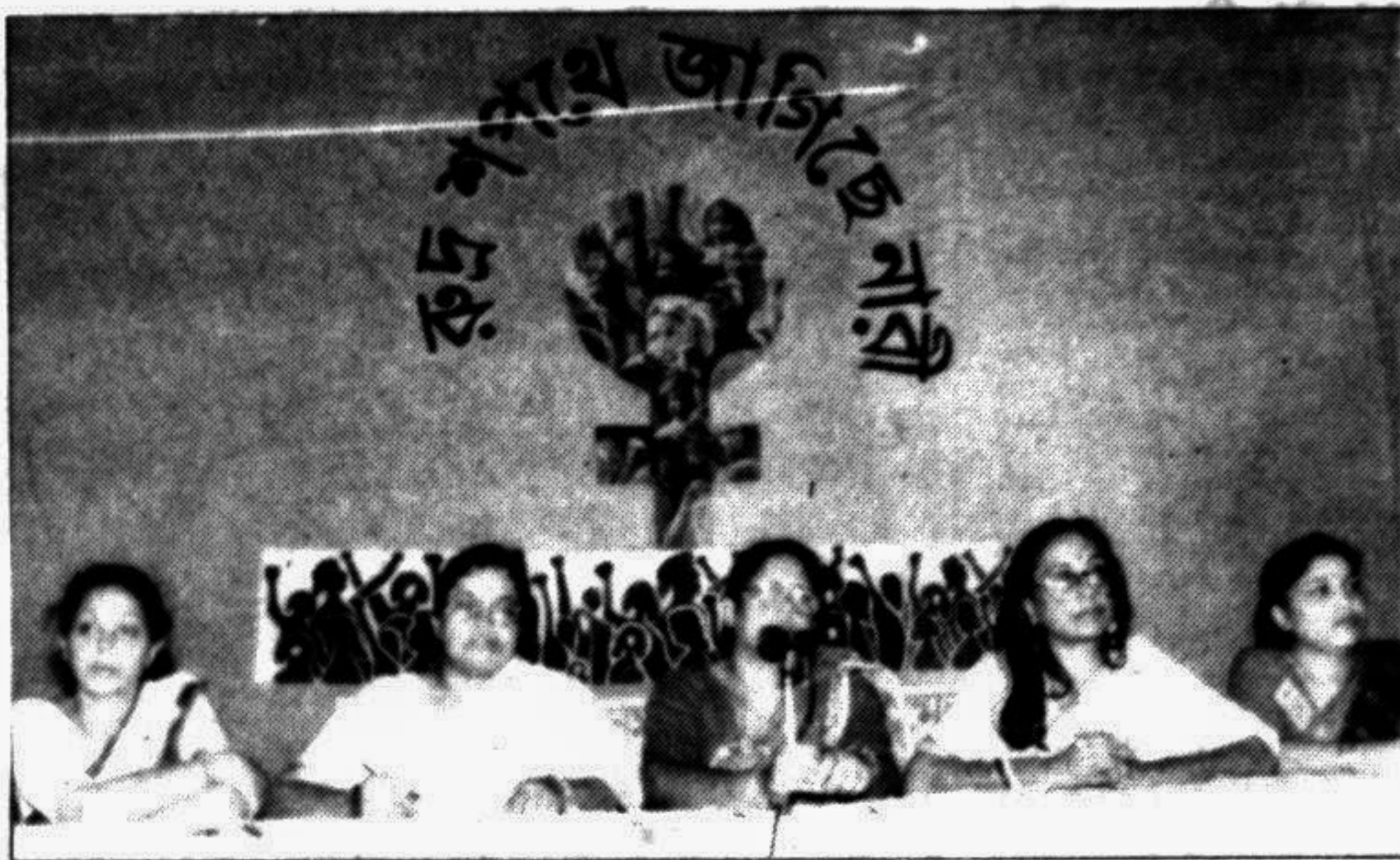
WOMEN AWAKEN WITH DETERMINED VOW: The concluding session of the first national conference of women's bodies at the Rice Research Institute in Gazipur yesterday.

Police said the Sherpur-bound bus plunged into a roadside ditch at about 4 pm when the driver lost control.