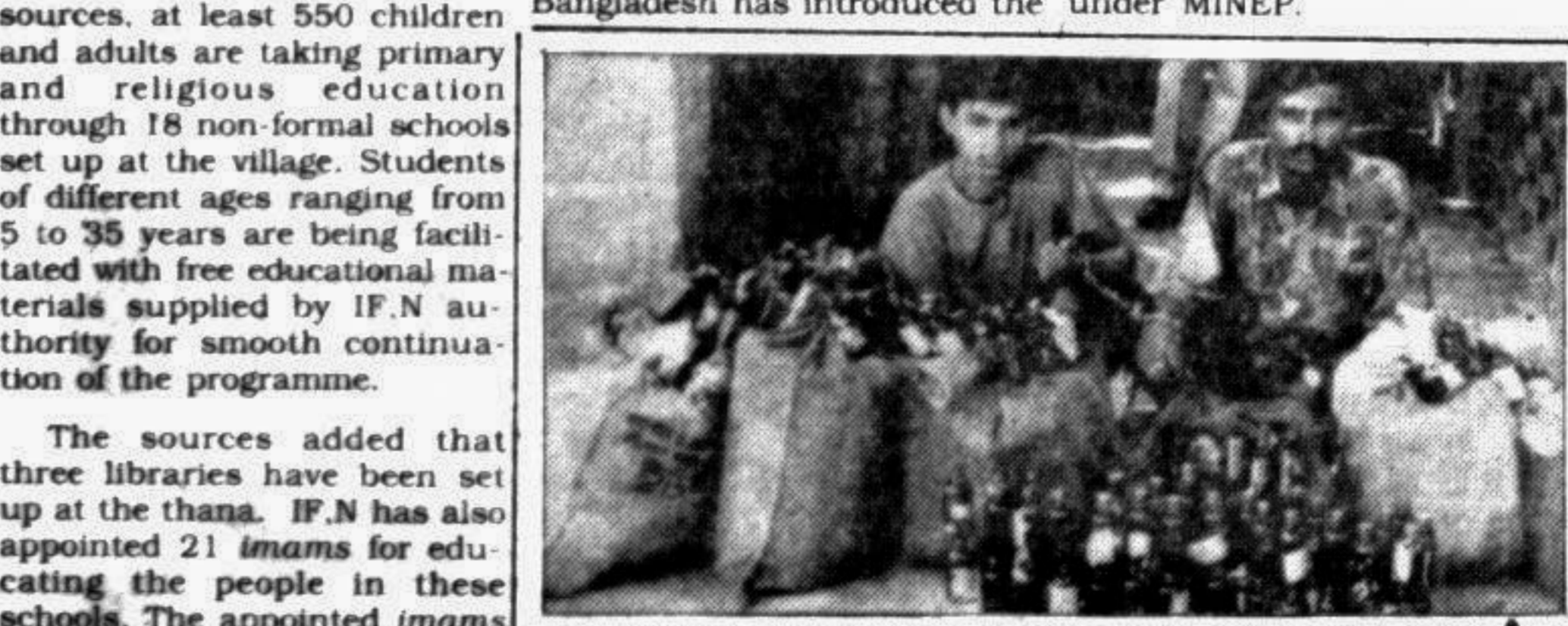
JHENIDAH: Police in a sudden raid seized 581 bottles of smuggled Phensidyl syrup from a Dhaka bound coach. Five Star Paribahan and arrested its driver and helper recently.

NATORE, Aug 8: An extensive mass education programme is going on in full swing at Gurudaspur thana of Natore district. With a view to ensure education for all within the year 2000, Islamic Foundation, Natore (IF.N) introduced the mass education programme, in 1993, under the mosque-based Integrated Non-formal Education Programme (MINEP) which has by now gained confidence of the people of Dharabarisa village of the thana. According to official sources, at least 550 children and adults are taking primary and religious education through 18 non-formal schools set up at the village. Students of different ages ranging from 5 to 35 years are being facilitated with free educational materials supplied by IF.N authority for smooth continuation of the programme. The sources added that three libraries have been set up at the thana. IF.N has also appointed 21 imams for educating the people in these schools. The appointed imams are given proper training prior to their appointment. Generally, Bengali, Mathematics and Arabic are