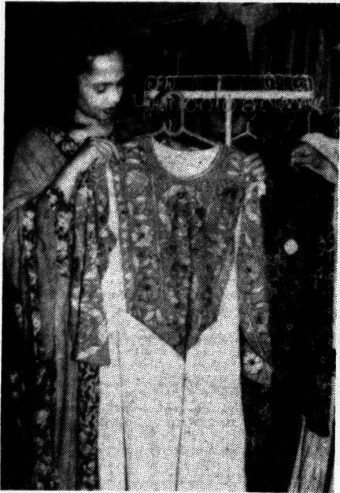
Angana, makes your selection of items an easy task.

Next time try out Angana, you will realise that it is a treasure trove.