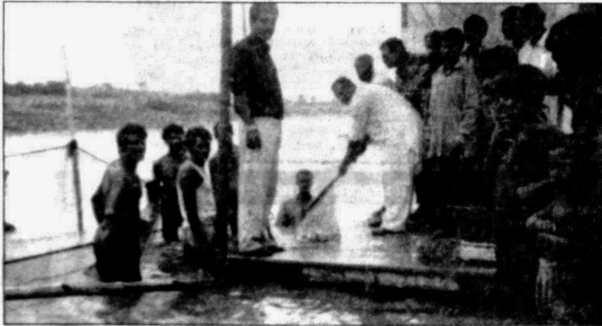
JHENIDAH, Fish fry are being released in a local pond under third fish project in the district.

These female workers earn their livelihood by husking paddy, working in brick-fields or work as day labourers and serving in different houses as maid servants.