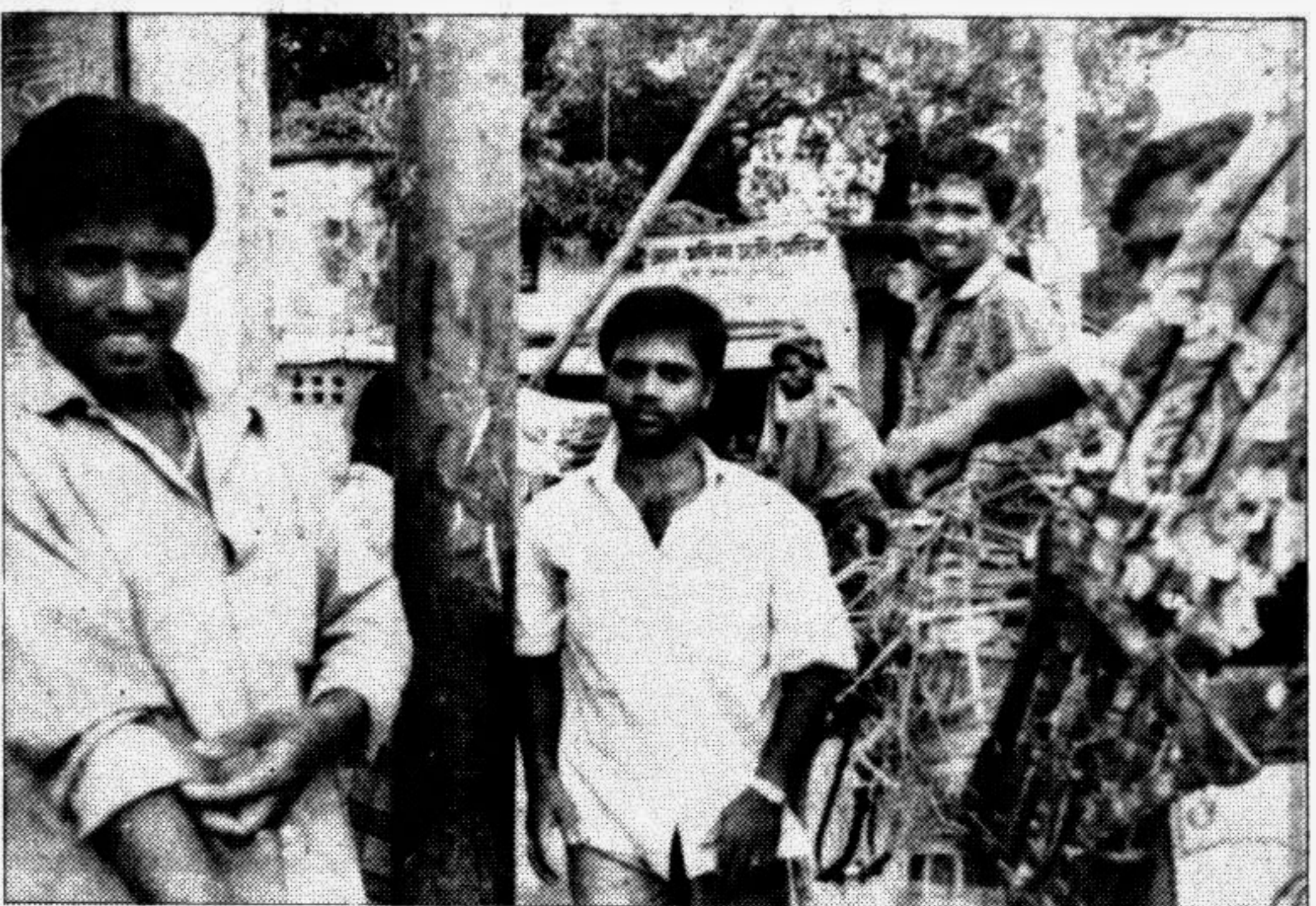
These two extortionists, collecting tolls openly from a small trader in a rickshaw, were taken aback when this photograph was taken in Waizghat area yesterday.

A high-level meeting of the government yesterday directed all concerned to gear up the post-flood rehabilitation activities to help the affected people recoup their losses, reports UNB. Held at the International Conference Centre (ICC) with Prime Minister Begum Khaleda Zia in the chair last night, the meeting reviewed the overall rehabilitation programmes and expressed its satisfaction over the performance of the agricultural sector. The meeting was informed that the authorities had already supplied seedlings to the affected farmers who have also planted the aman paddy. See Page 12 Col 4