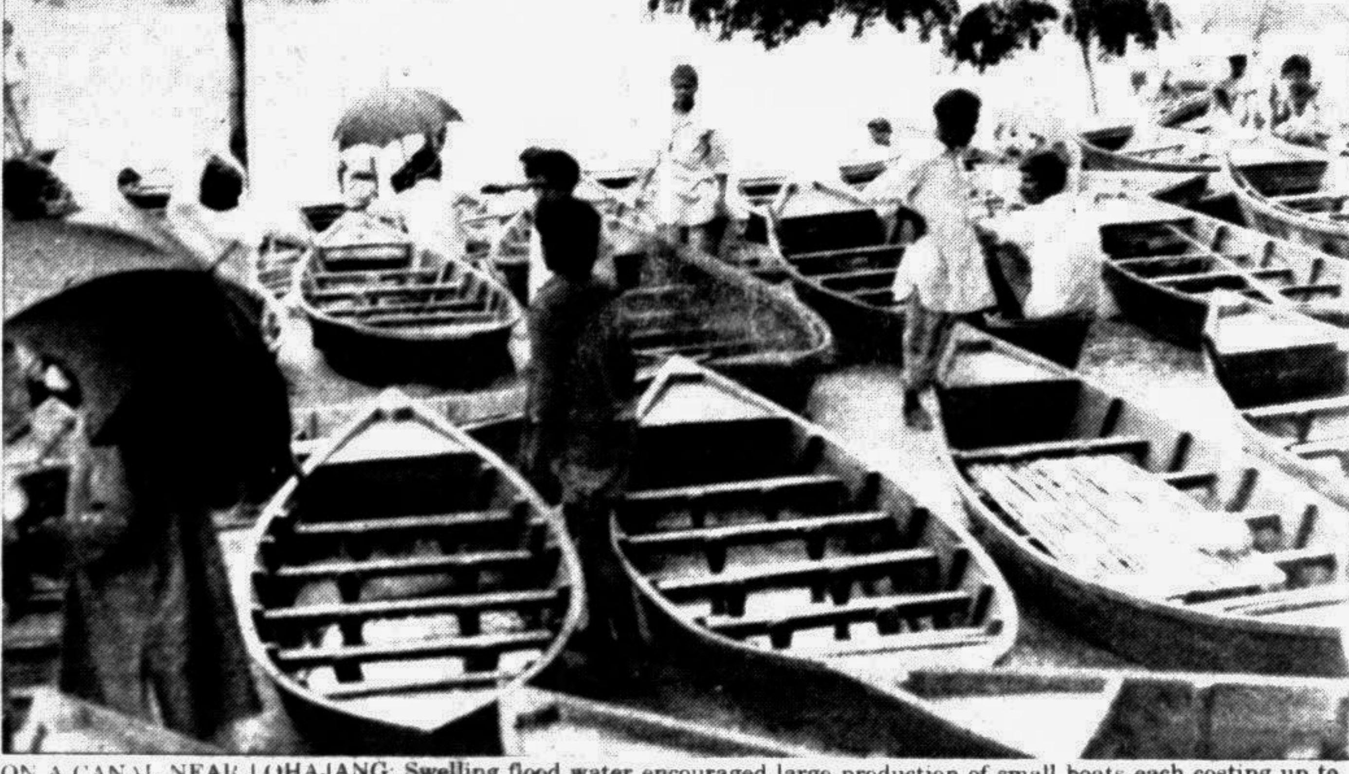
ON A CANAL NEAR LOHAJANG: Swelling flood water encouraged large production of small boats each costing up to Tk 3,000. By the time these arrived in the market, the water level in the area had registered a substantial fall.

From Our Correspondent NARAYANGANJ, Aug 7: A group of street urchins stunned shopowners in the DIT market in the town yesterday by blasting cocktails and ransacking a shop. According to witnesses, some eight to nine street urchins armed with cocktails and sharp weapons attacked some shops all of a sudden at around 12:30 pm. The children, aged between eight to 12, damaged a show case of a cloth store and blasted four cocktails. Shopowners at first pulled down shutters within minutes of the cocktail blasts. See Page 12 Col 1