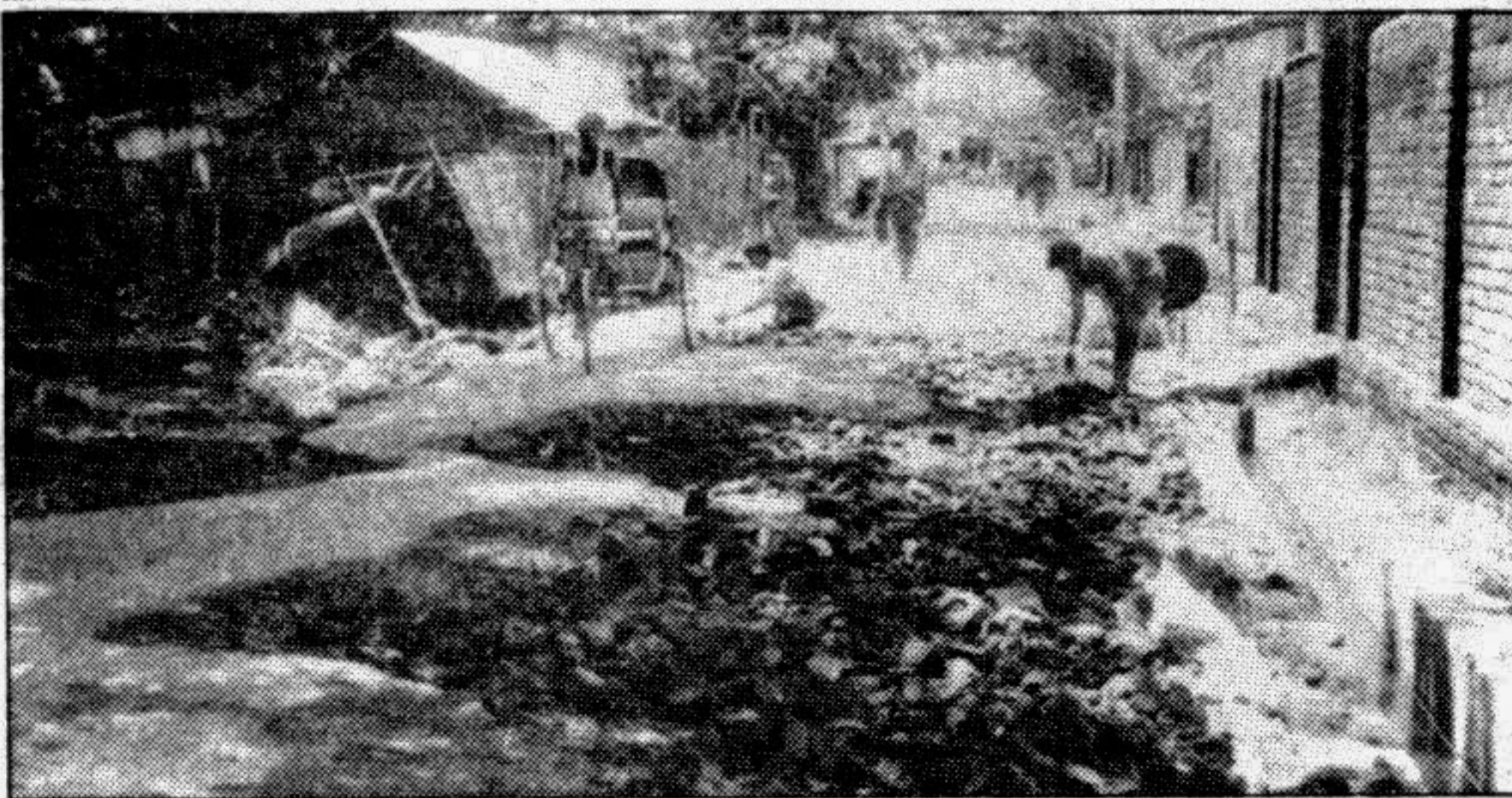
GAIBANDHA: Recent flood damaged several roads of Gaibandha town. The picture shows the damaged part of Gaibandha — Sadullahpur thana road at Khanka Sharif point (top) and the damaged part of Gaibandha — Fulchhari road (bottom).

The worst-hit thanas are Sadullapur, Sunderganj and Fulchhari where road communication was affected severely by the surging water. Roads connected with flood-hit thanas went under three to four feet water that caused maximum damages to the upper surface of the roads.