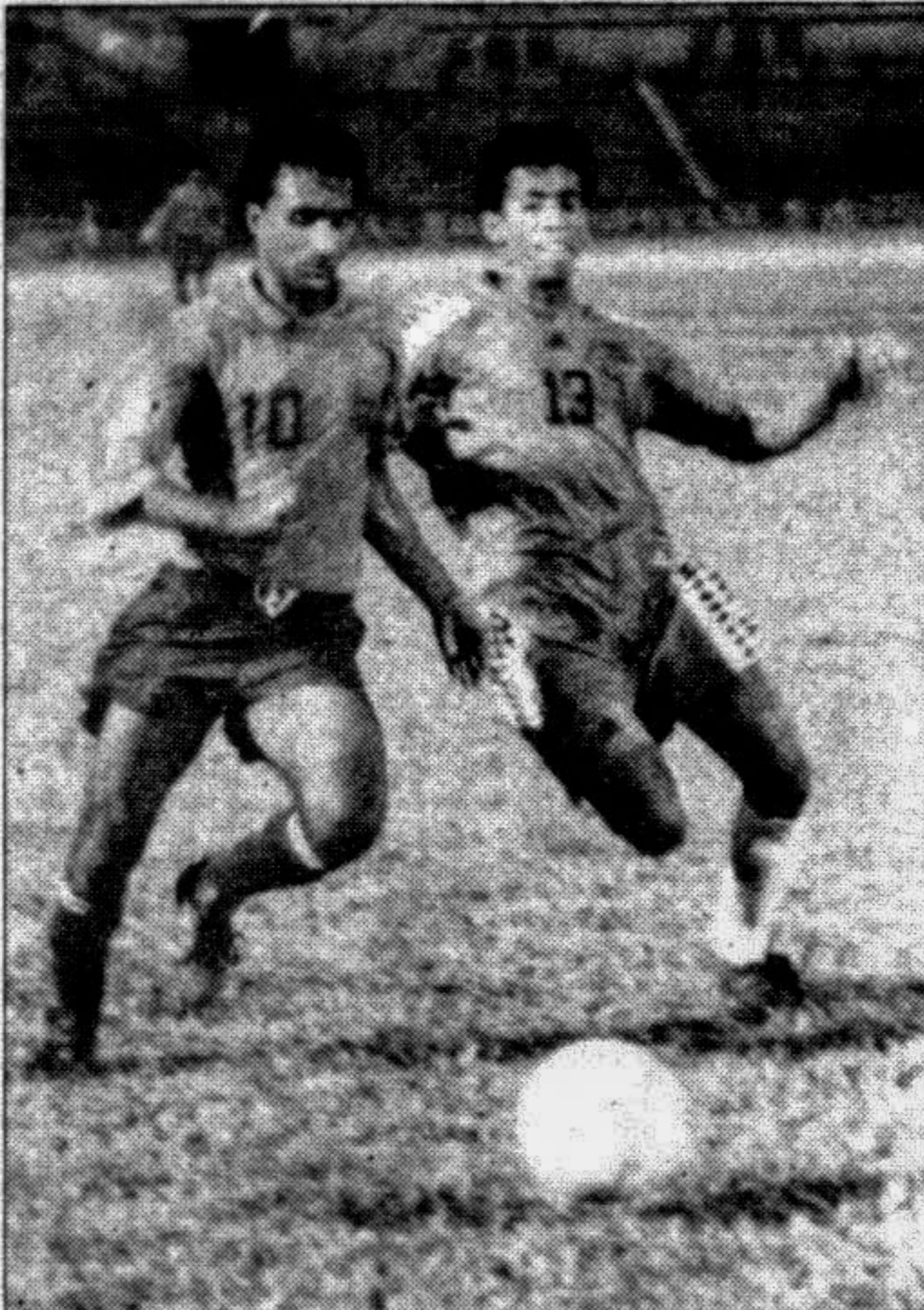
Mid-pitch action from yesterday's Lifebuoy Premier Division football league encounter between Public Works Department (PWD) and Bangladesh Boys at the floodlit Dhaka Stadium. The match ended goalless.