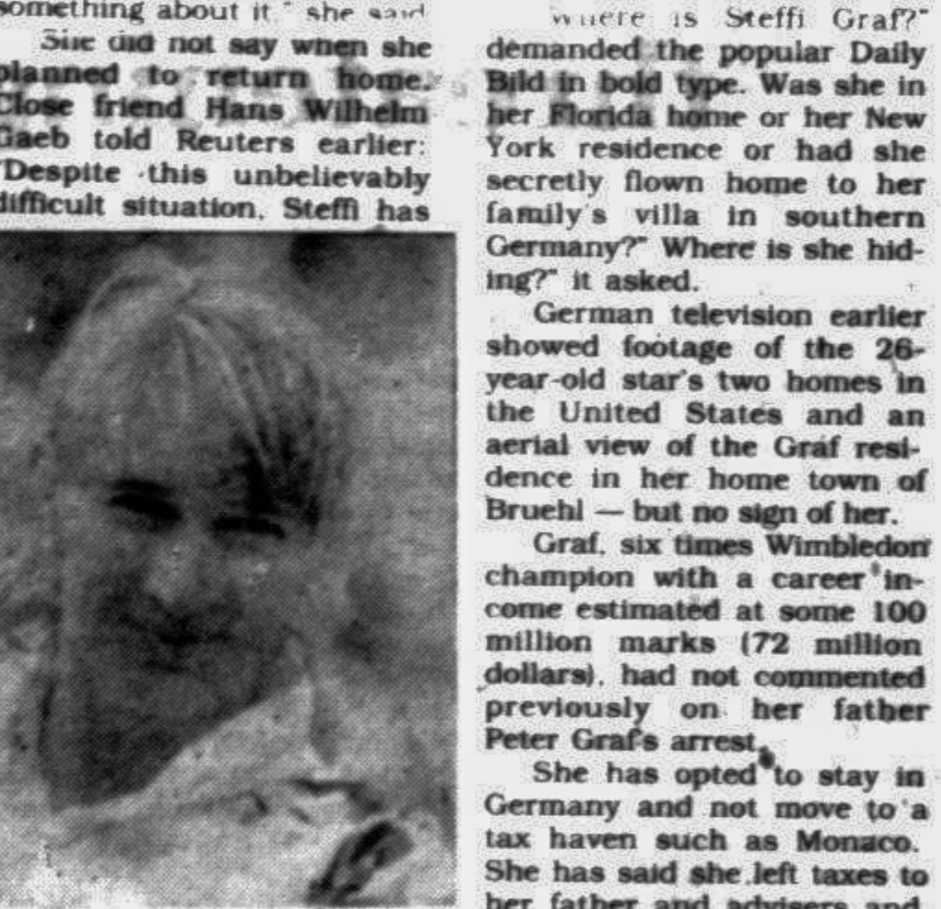
STEFFI GRAF kept a clear head. She is certain that she never consciously did anything wrong.

BONN, Aug 5: Steffi Graf, whose father was arrested this week on suspicion of tax evasion in a probe that also targets her, on Friday dismissed speculation she might quit tennis, reports Reuter. "The thought never occurred to me," the world number one told Germany's ARD television in an interview in New York. In a quaking voice uncharacteristic of the German tennis star known for her cool and self-assured manner, she admitted she had put all her efforts into her game and had neglected her financial affairs. "Certainly in the last 10 years I have mainly concentrated on my tennis and I made a mistake that I did not take care of my financial affairs. Now I must take the consequences," she said, looking clearly upset by the affair. "In the next days I must think about taking more responsibility or full responsibility for these things and do