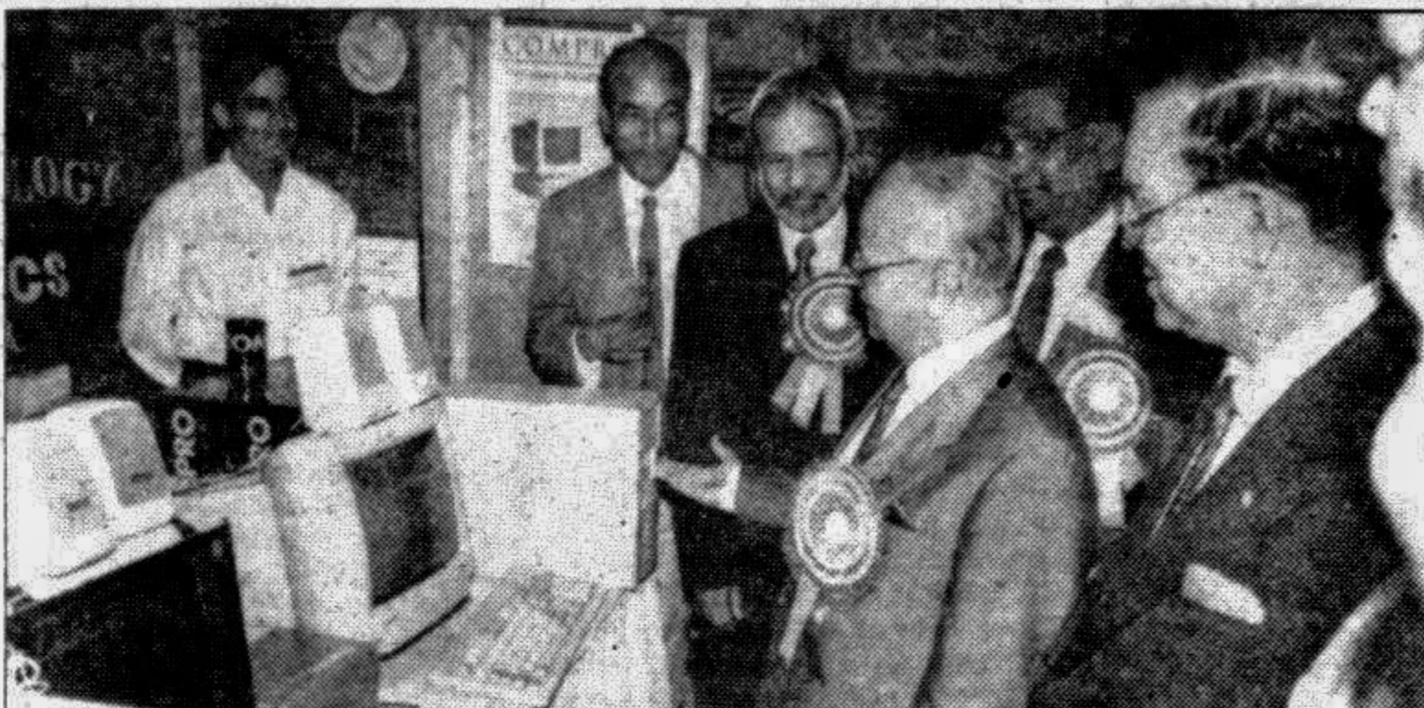
President Abdur Rahman Biswas inaugurated the annual convention of Bangladesh Computer Society (BCS) at the Institution of Engineers in the city on Friday.