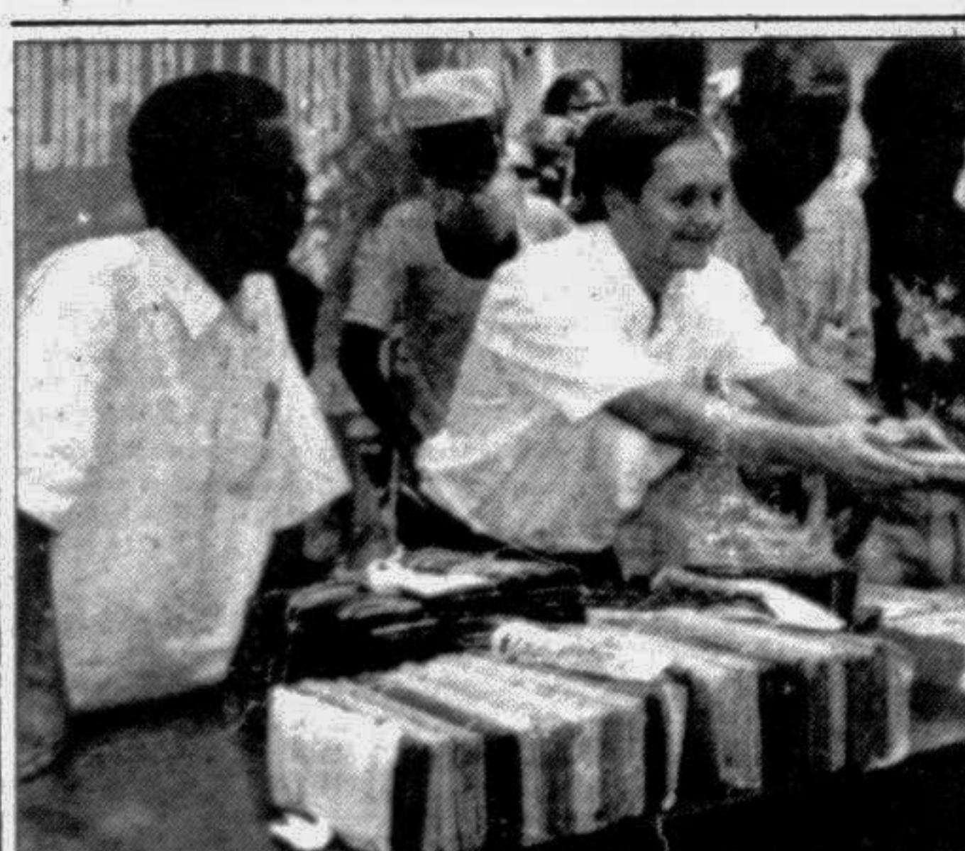
Romain Vuillaume, First Secretary of the Embassy of France, distributing relief materials among the flood affected people of Rulipara village of Gabsara union of Tangail recently.

Turning to the education sector the finance minister said, during the current financial year a record amount of Tk 4500 cr will be spent for the development of education which is the backbone of all national development. He said, due importance is also being given to female education.