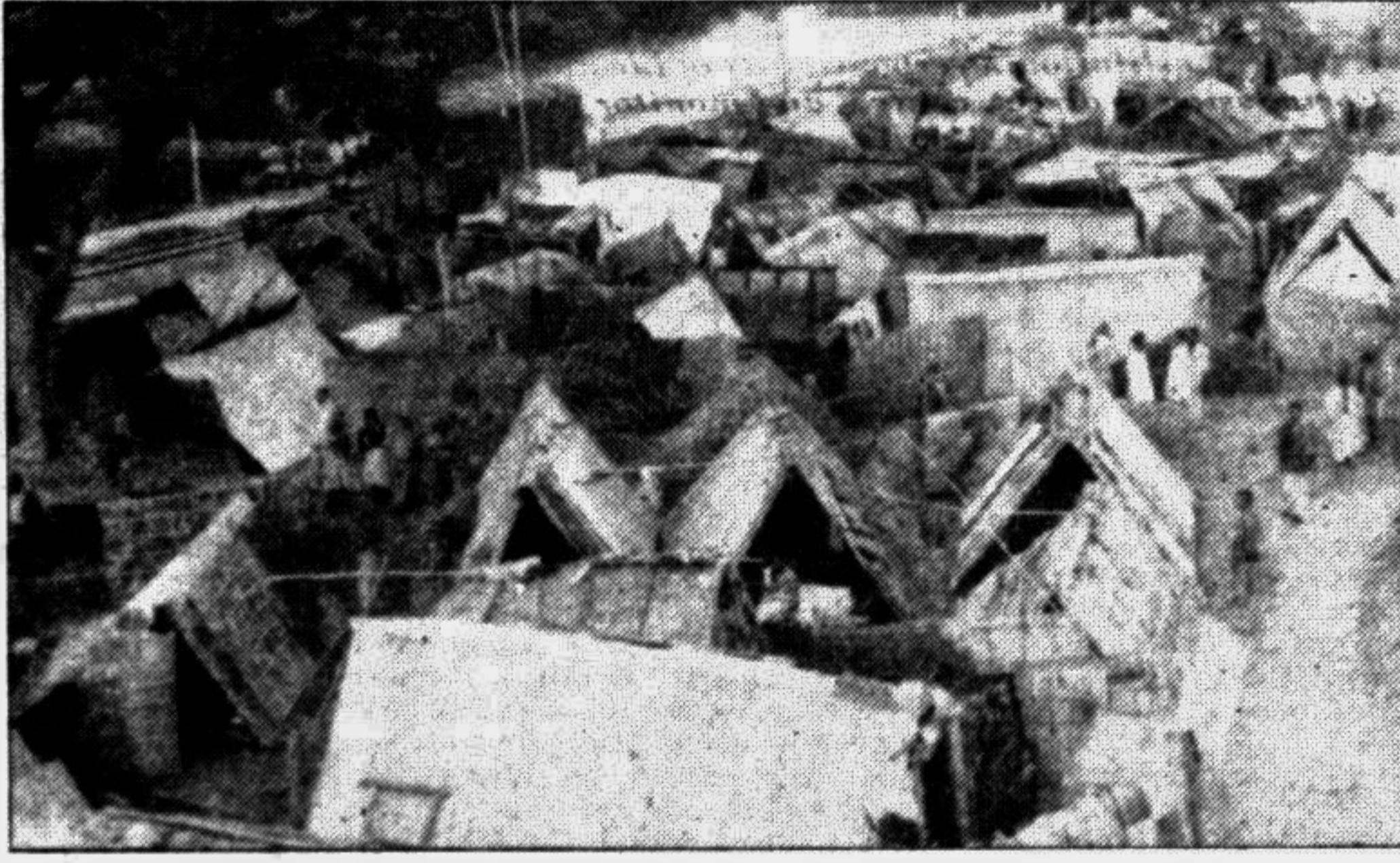
CHANDPUR: Flood affected people have taken shelter on the embankment with their dismantled dwellings and other belongings.