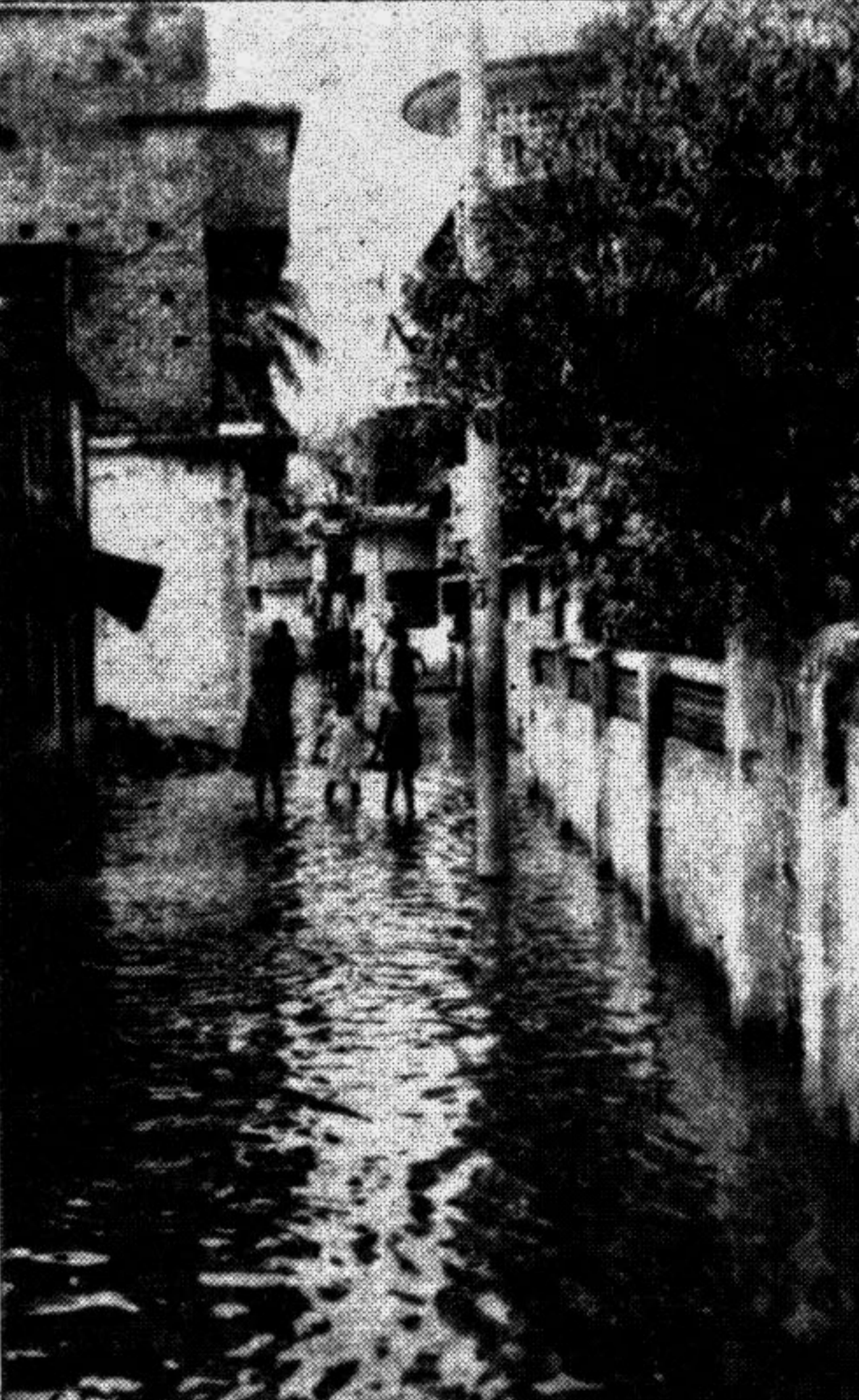
A COMMON SCENE IN THE MONSOON: Heavy shower is regularly causing water logging in parts of Rajshahi city including the premises of Rajshahi Medical College Hospital, Bangladesh Bank, Radio Bangladesh, Divisional Public Library and Laboratory High School. Streets in some points, most of the lanes and by lanes and ground floor of dwellings are also inundated by rain water. It may take upto five days to drain out the rain water. This picture was taken from Sabjipara, a muhalla near the city corporation office after two days of rain.