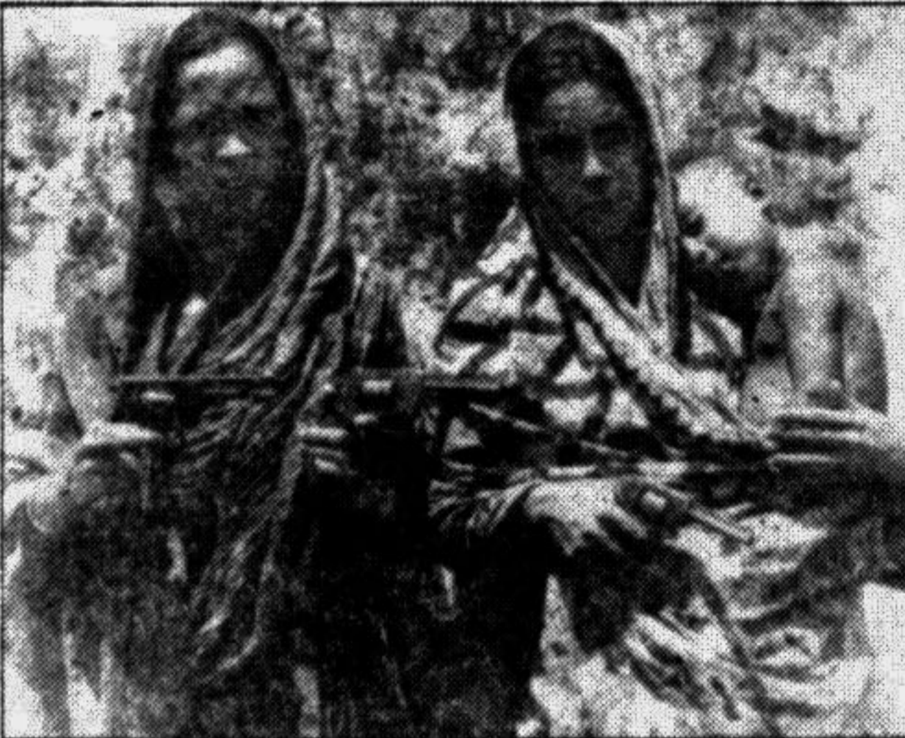
SYLHET: BDR caught these two women smuggling two revolvers into Bangladesh through the border point of Doarabazar thana recently.