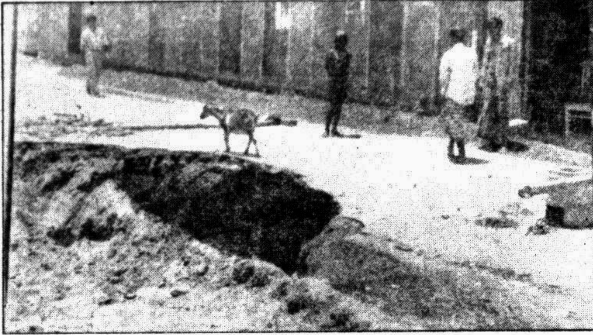
SIRAJGANJ: The Post Office Road in the town was badly affected by the recent flood.

SIRAJGANJ, Aug 2: The recent devastating floods have incurred heavy loss of property and valuables amounting to Taka more than 71 crore in Sirajganj district alone.