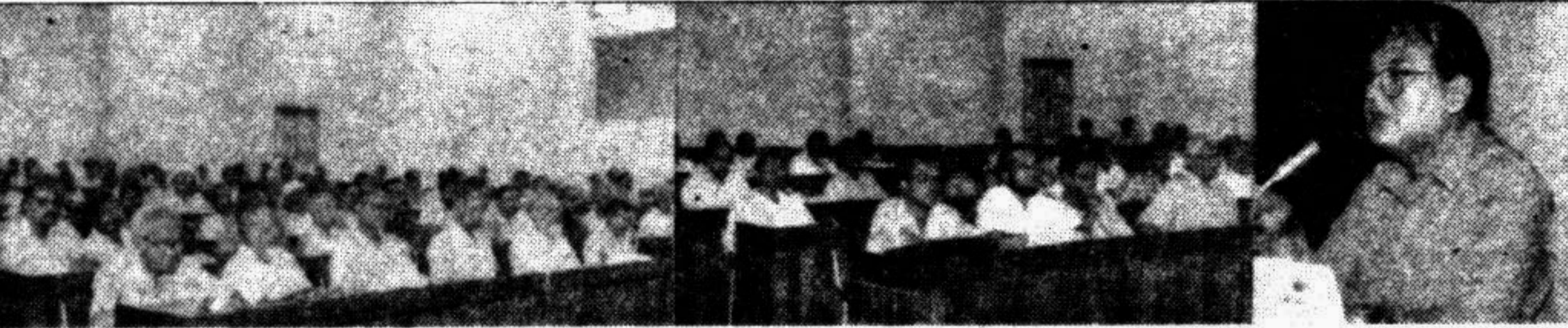
RAJSHAHI UNIVERSITY: The Vice-Chancellor of Rajshahi University Prof Eusuff Ali addressing (C) the teachers of RU after July 22 incident in which several students were injured in a clash between two political student wings, JCD and ICS. The VC also addressed the officers of the university (L) following the incident briefing them about the latest situation in the campus.

The local people including farmers within polder Nos 2 and 4 of the project irrigate water to their high yielding paddy fields, the flood water recedes through the canals which also serves as a means of navigation. They fish in the canals and collect fish-feed, namely, the snail for shrimp culture and also the canal water is used for domestic purposes. As such the local people have been resisting to close the canals' mouth and demanding to construct the water control structures there.