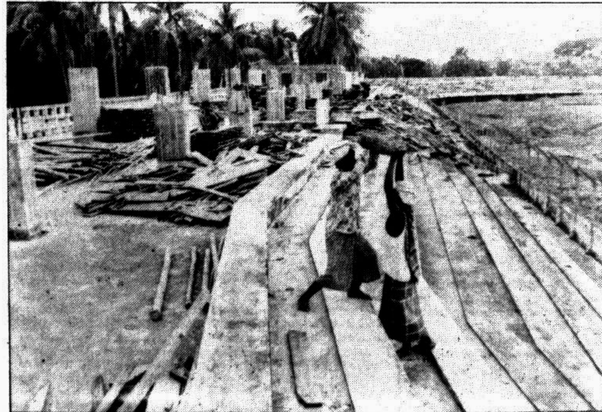
Construction works of the Hockey Stadium gallery in the city is going on at a snail's pace. This photo was taken yesterday.