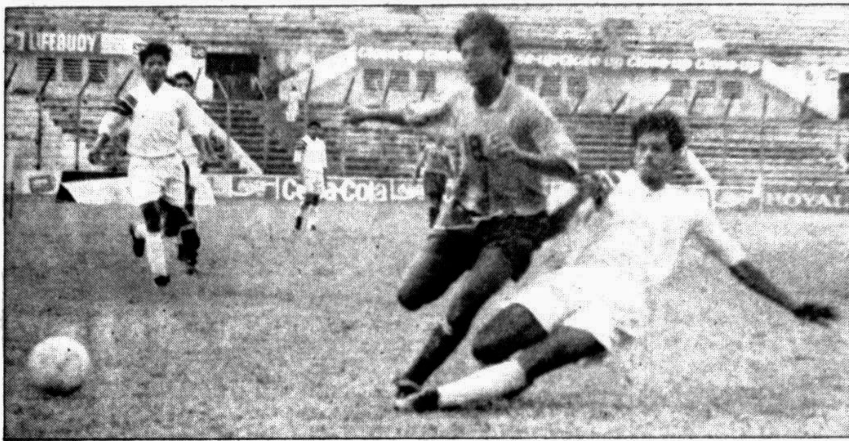
Action from yesterday's Lifebuoy First Division football league encounter between Badda Jagorani and PWD at the Dhaka Stadium. The match ended goalless.