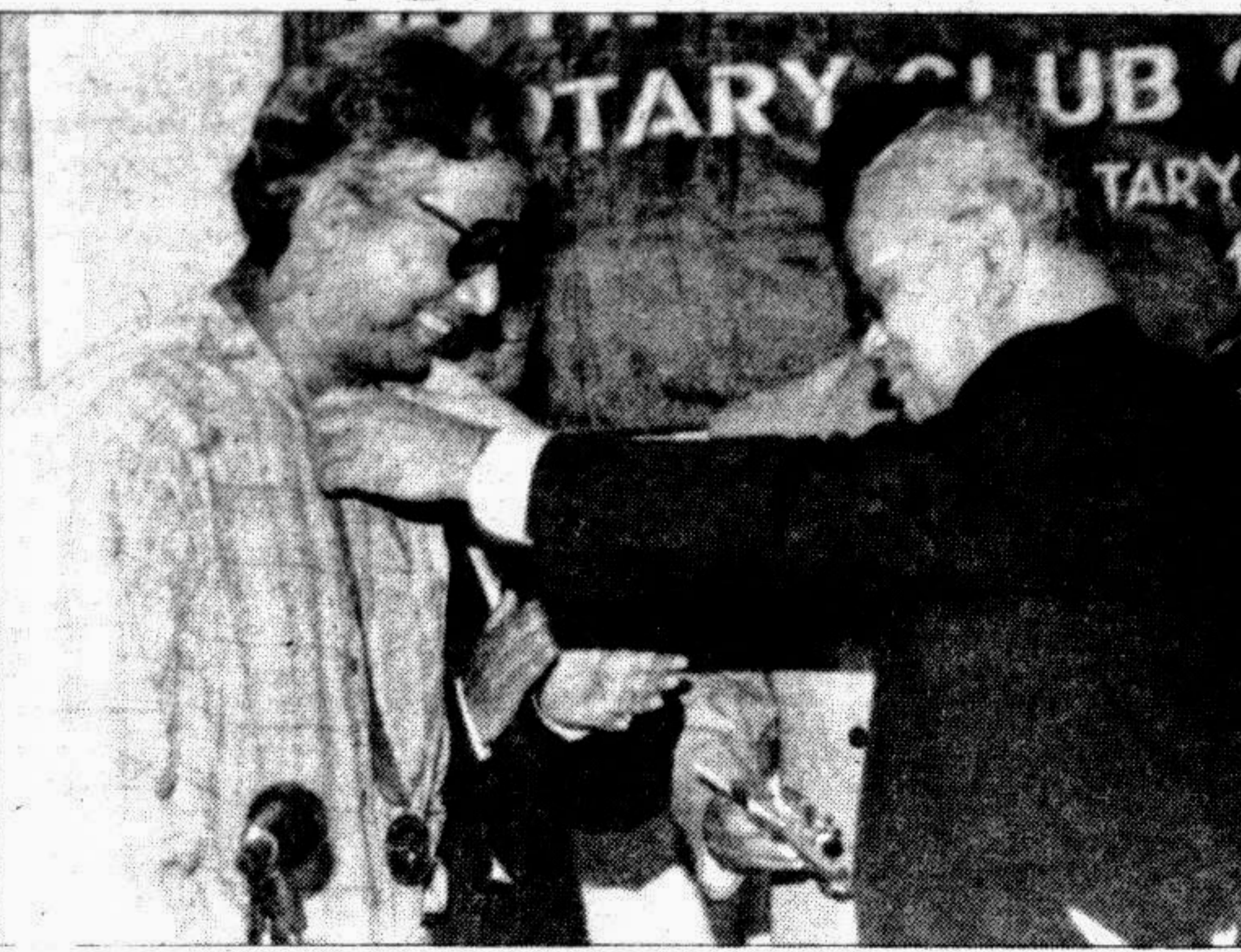
President Abdur Rahman Biswas presenting Dr. Muhammad Yunus the RCMD Foundation medal at a ceremony in the city yesterday.

The sun sets today at 6:41 pm and rises tomorrow at 5:28 am.