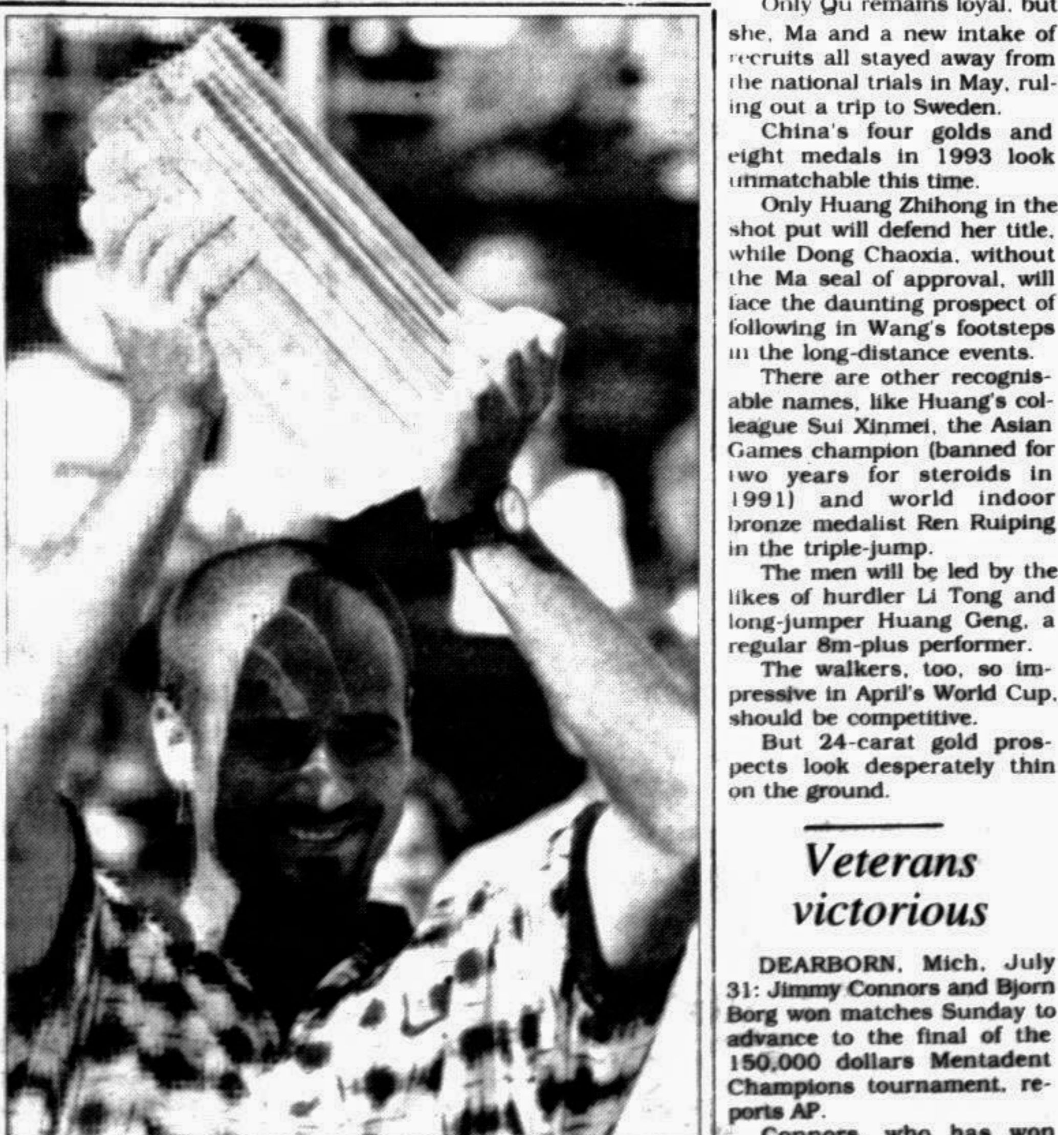
A triumphant Andre Agassi holds aloft the Canadian Open trophy after overcoming compatriot Pete Sampras 3-6, 6-2, 6-3 in the final in Montreal on July 30.

Dutch Open Rios AMSTERDAM, July 31: Chilean qualifier Marcelo Rios won the Dutch Open on Sunday, comfortably beating Dutchman Jan Siemerink 6-4, 7-5, 6-4, reports Reuter. Rios who had to qualify after arriving too late to make the draw, took the 66,400 dollar first prize after an two hour long match played under a sweltering sun. The diminutive 19-year-old's powerful forehand complemented cat like agility and deft touches at the net to overwhelm his big serving opponent. Rios, ranked 57th in the world, said he entered the tournament only after failing to get an immediate flight home to Santiago after losing in the second round of the Mercedes Cup in Stuttgart last week.