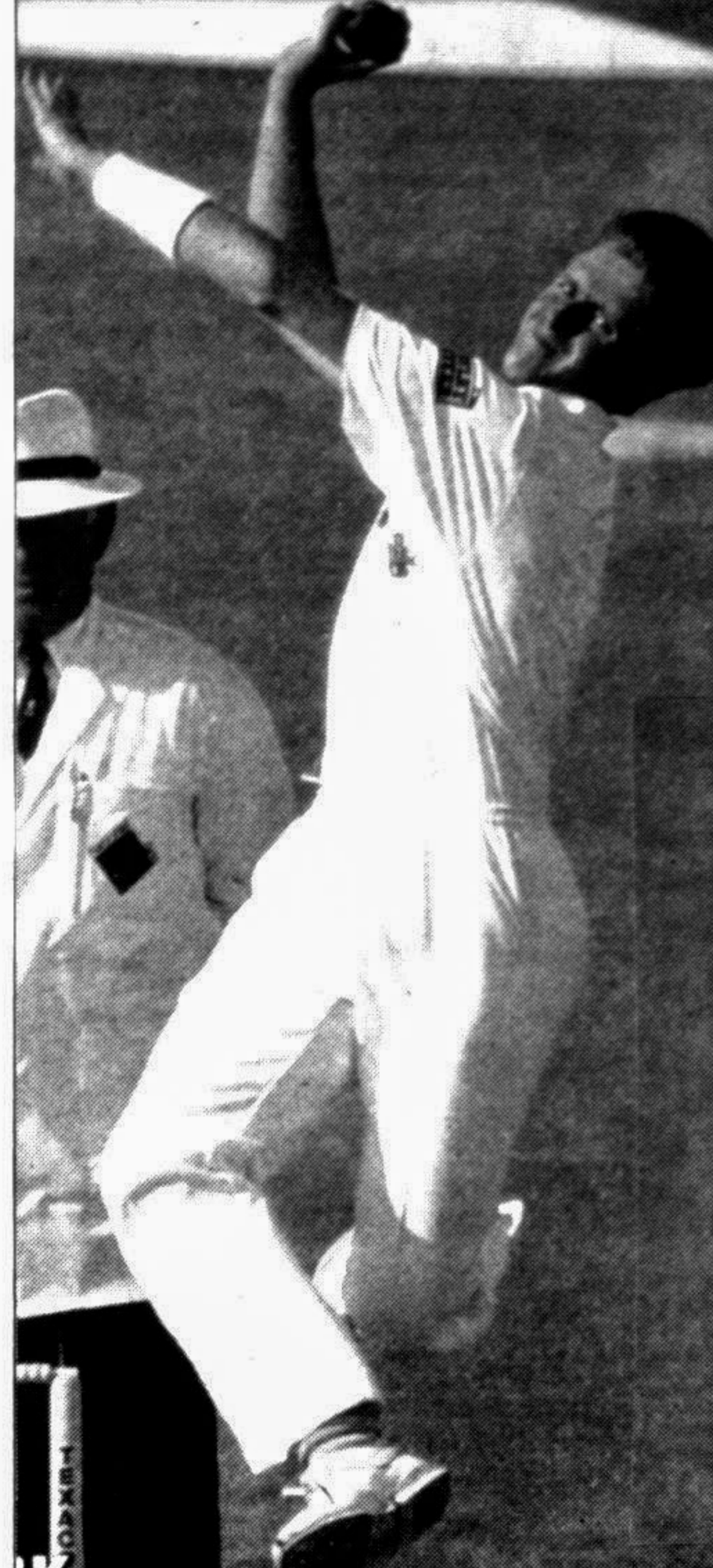
DOMINIC CORK... man-of-the-match

After Atherton's dismissal, Bishop immediately struck when he had Nick Knight caught in the slips for 13, then Graham Thorpe, top scorer with 94 in the first innings, was caught off Kenny