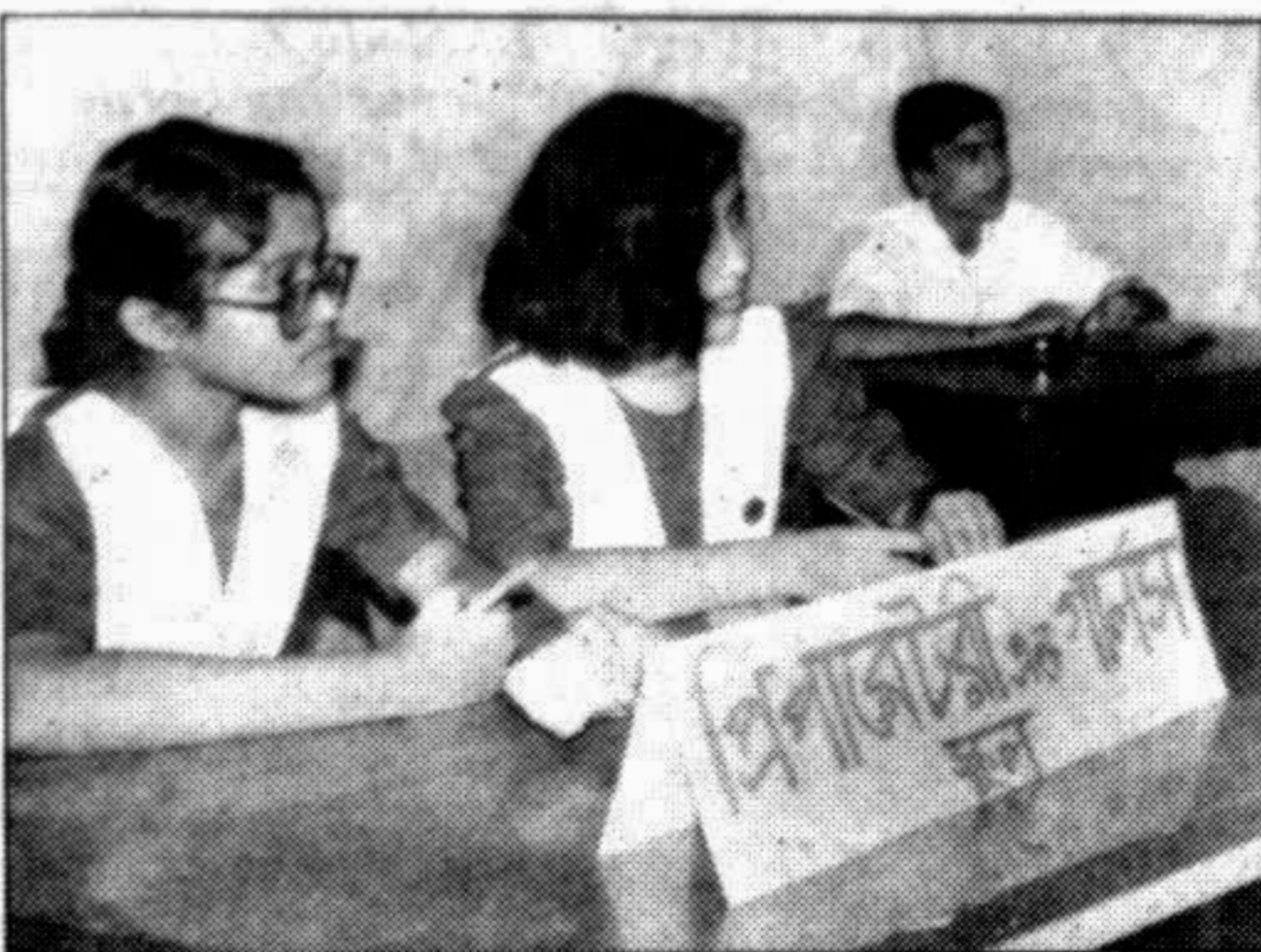
Participants at a quiz competition organised by the Science and Debating Club of Udayan Bidyalaya at the ICMA auditorium in the city yesterday.