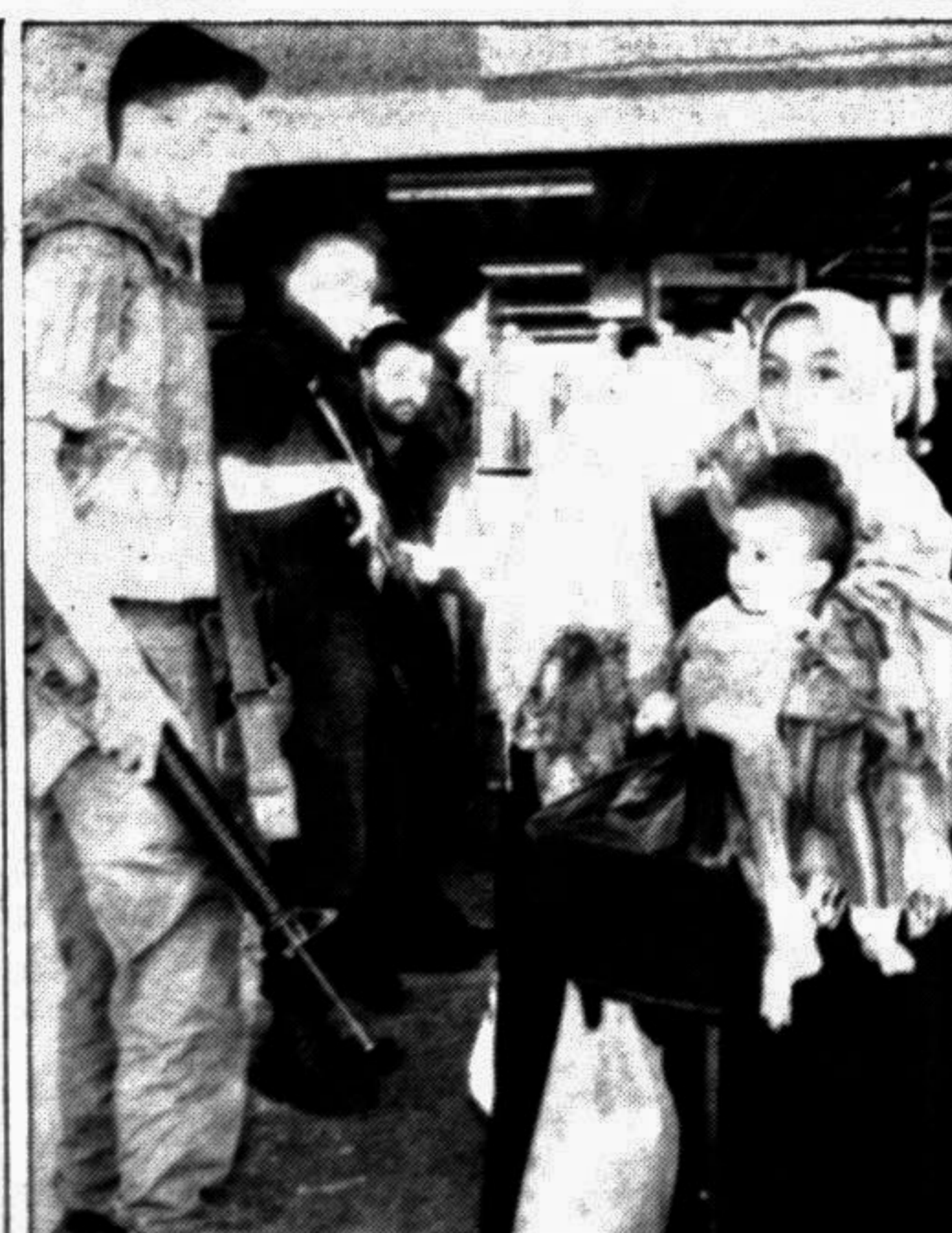
An Israeli soldier controls the entrance of a Palestinian woman passenger carrying her baby at Erez crossing point in Gaza Strip yesterday as the Israeli army reopened the crossing points from the Gaza Strip and West Bank, a week after a suicide bomber killed six people on a Tel-Aviv bus in Israel.

An aircraft of the airlines successfully landed at the Shamshearnagar Airport after checking the route today. See Page 12 Col 7