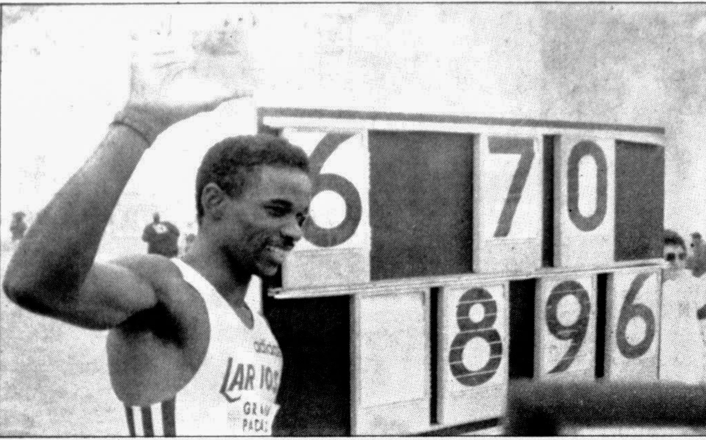
THE SCOREBOARD SAYS IT ALL: Ivan Pedroso of Cuba, stands beside the scoreboard that reads 8.96m which is the new world record he set for the long jump at an athletics meeting in Italy yesterday. Pedroso broke American Mike Powell's 1991 by one centimetre.