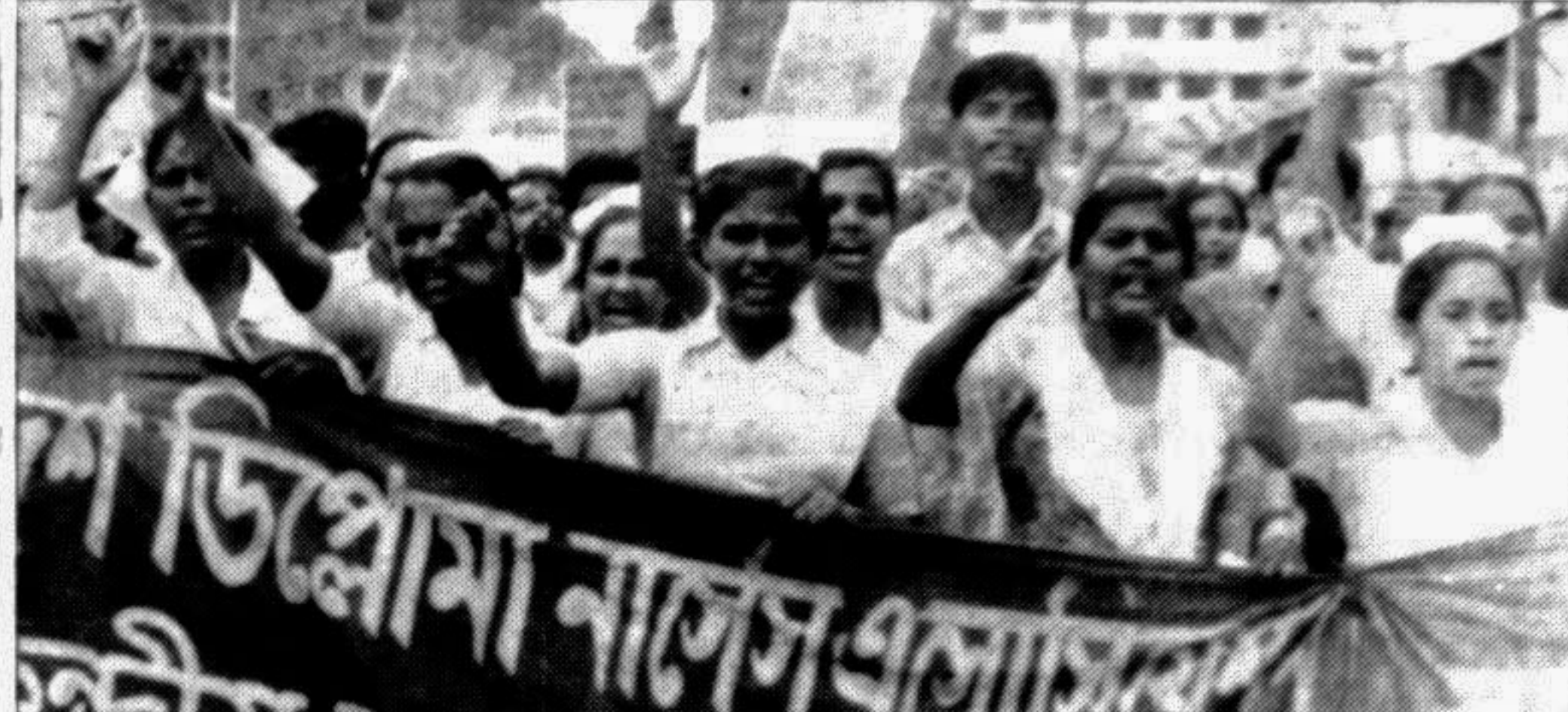
Members of the Bangladesh Diploma Nurses Association paraded the city streets yesterday demanding implementation of their 12-point charter of demands.

ডিএফসি-১৮০৪-২৬/৭ পুলিশ সুপার জি-১১৪৪ কুড়িগ্রাম।