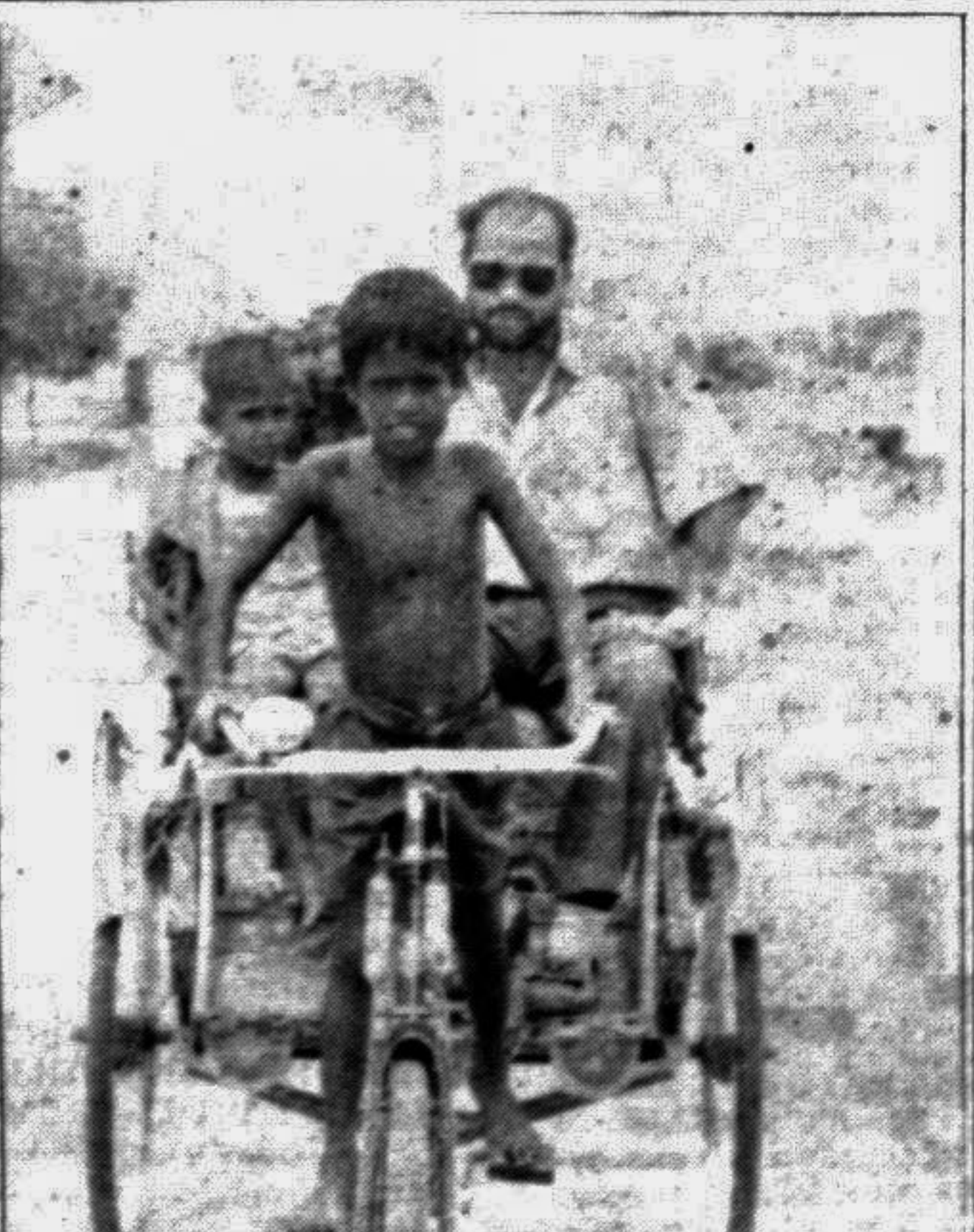
Poverty compelled this teen-aged boy, from a neighbouring village, to pull rickshaw in Brahmanbaria town.

A large number of district commissioners, scouts and rovers attended the function.