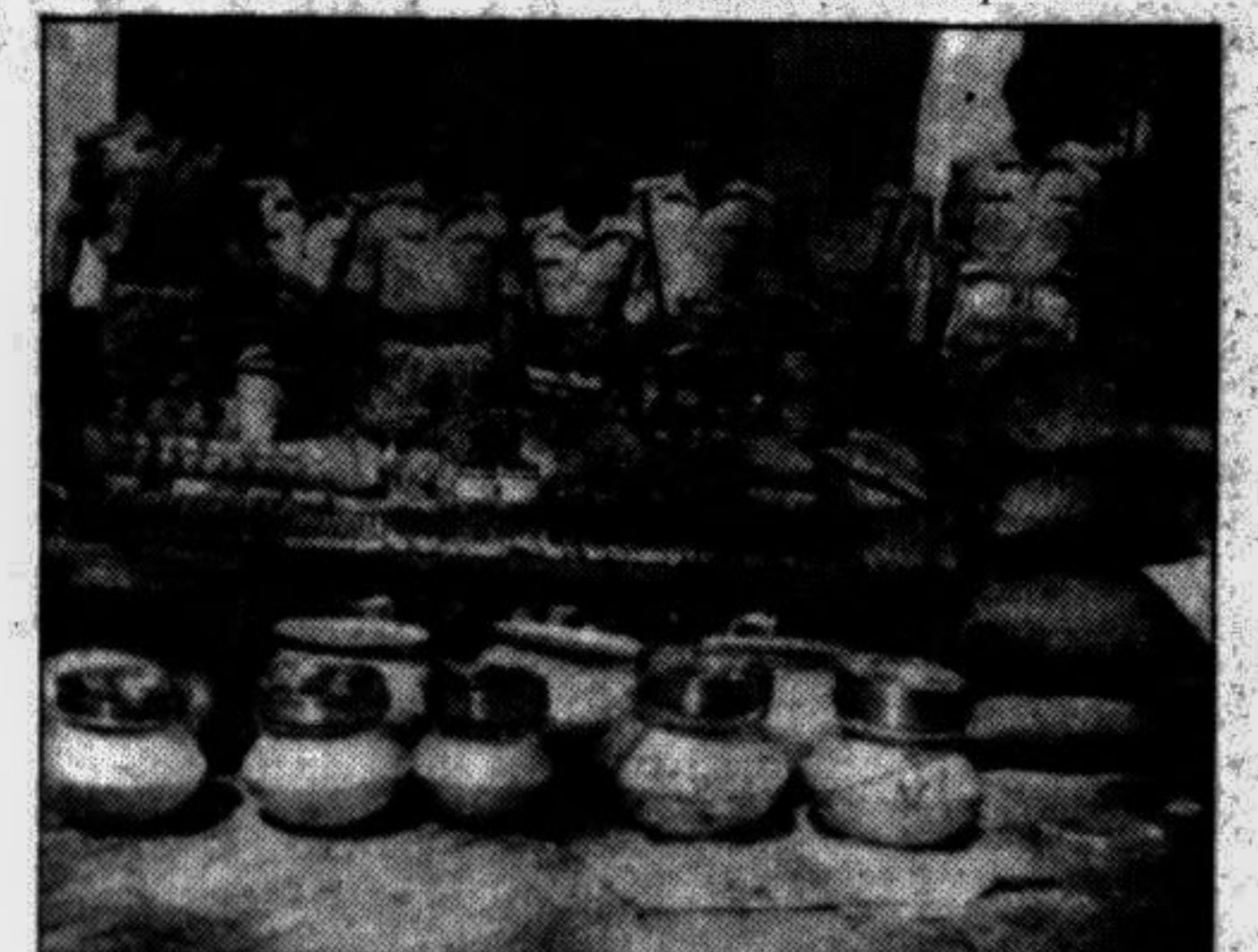
SATKHIRA: A partial view of smuggled goods recovered by the BDR personnel during last six months.

The smuggled goods include Indian cycle, cycle parts, jute seeds, machineries, phensedyl syrup bottles, cosmetics, cows, hide and skin, sarees, utensils, pulses, sugar, salt and spices.