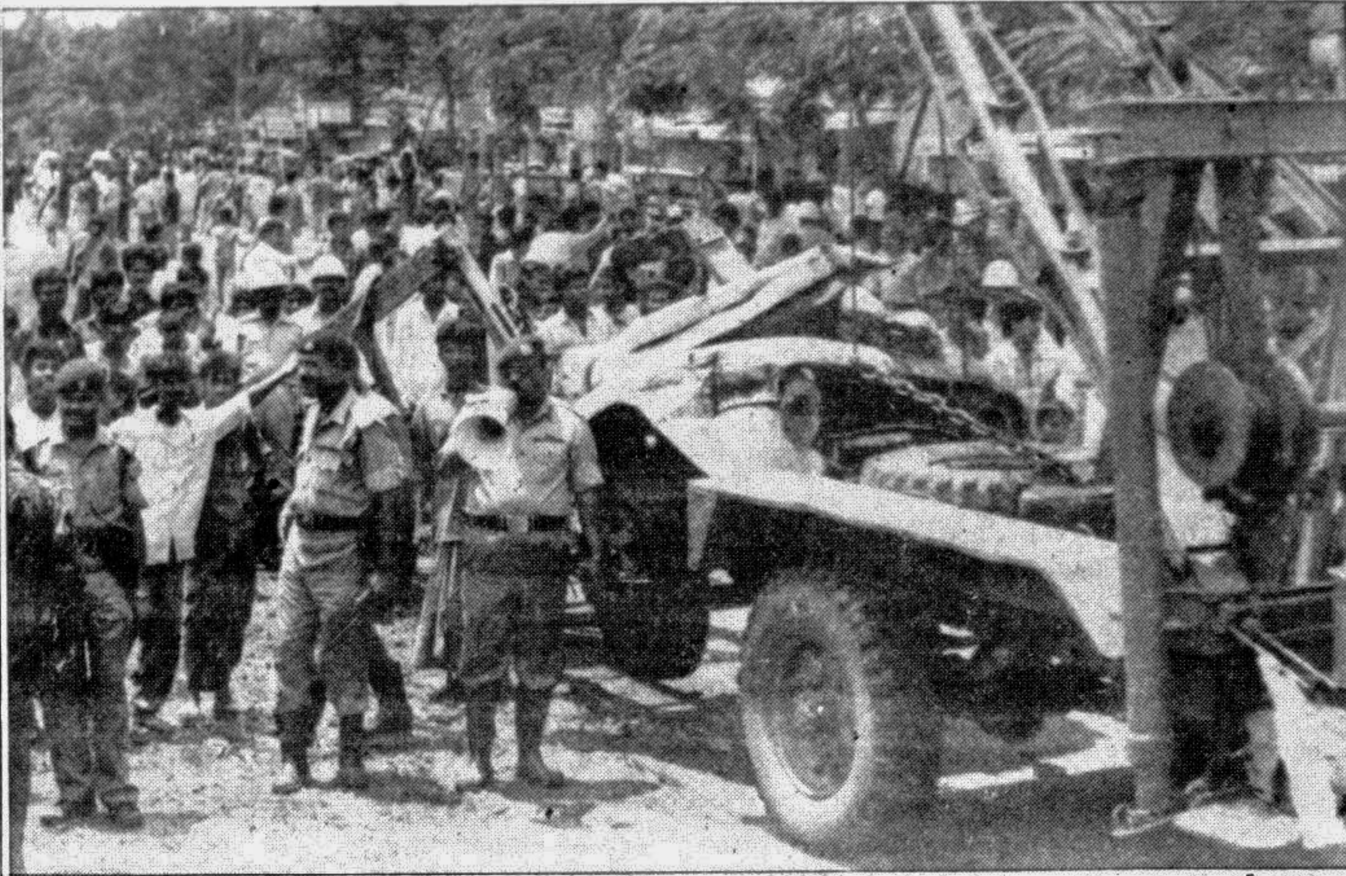
The Dhaka Metropolitan Police evicting unauthorised spare-parts shop owners from the pavement of city's car spare market at Dholaikhal yesterday. Story on back page

Moudud, who had participated in a seminar on "Development and Democracy in the Third World" in London, said disallowing Ershad to talk with his lawyer gave an impression abroad that this government does not believe in the rule of law.