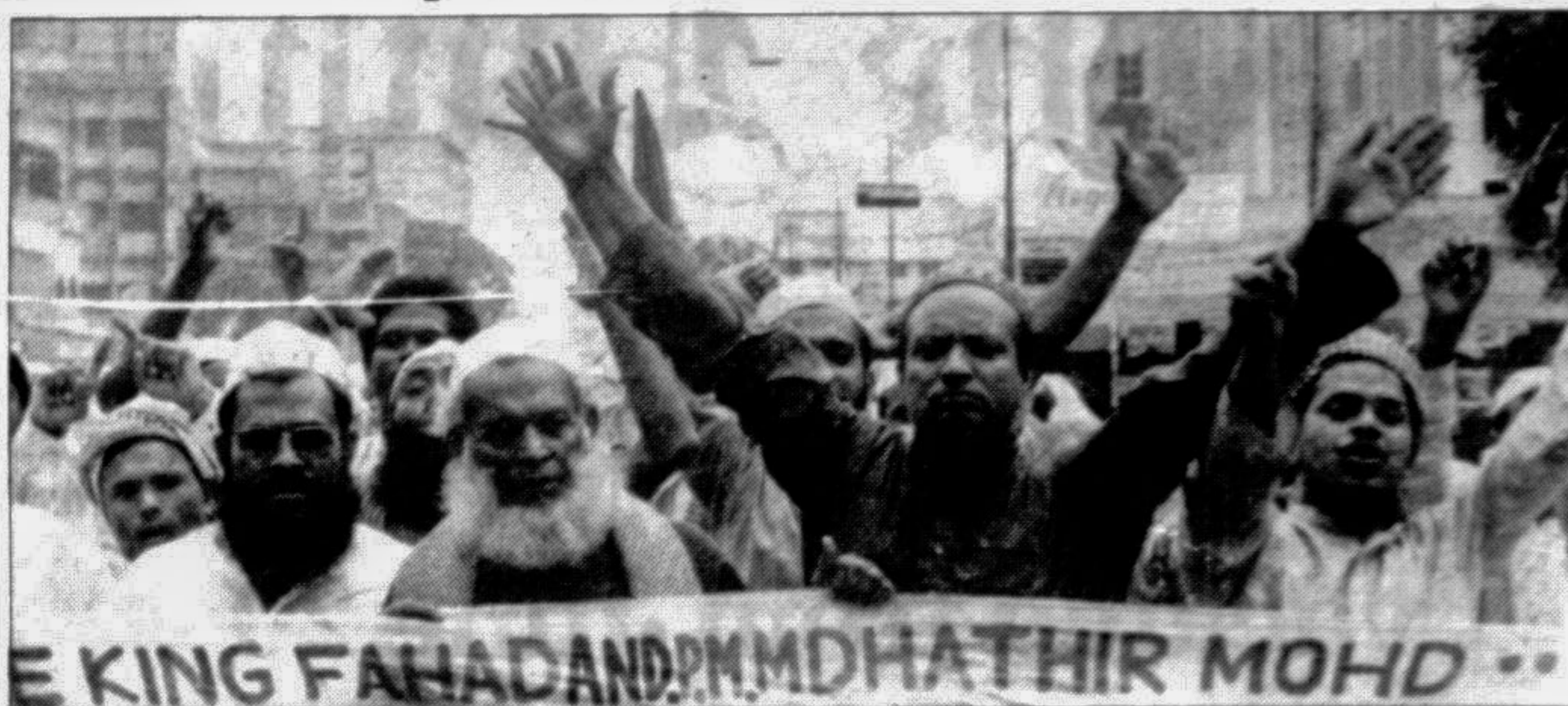
The Bangladesh Khelafat Andolan brought out a procession in the city yesterday protesting Serb atrocities on the Bosnian Muslims.