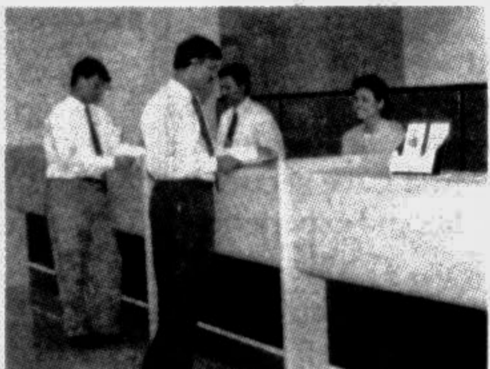
Friendly, personalized service