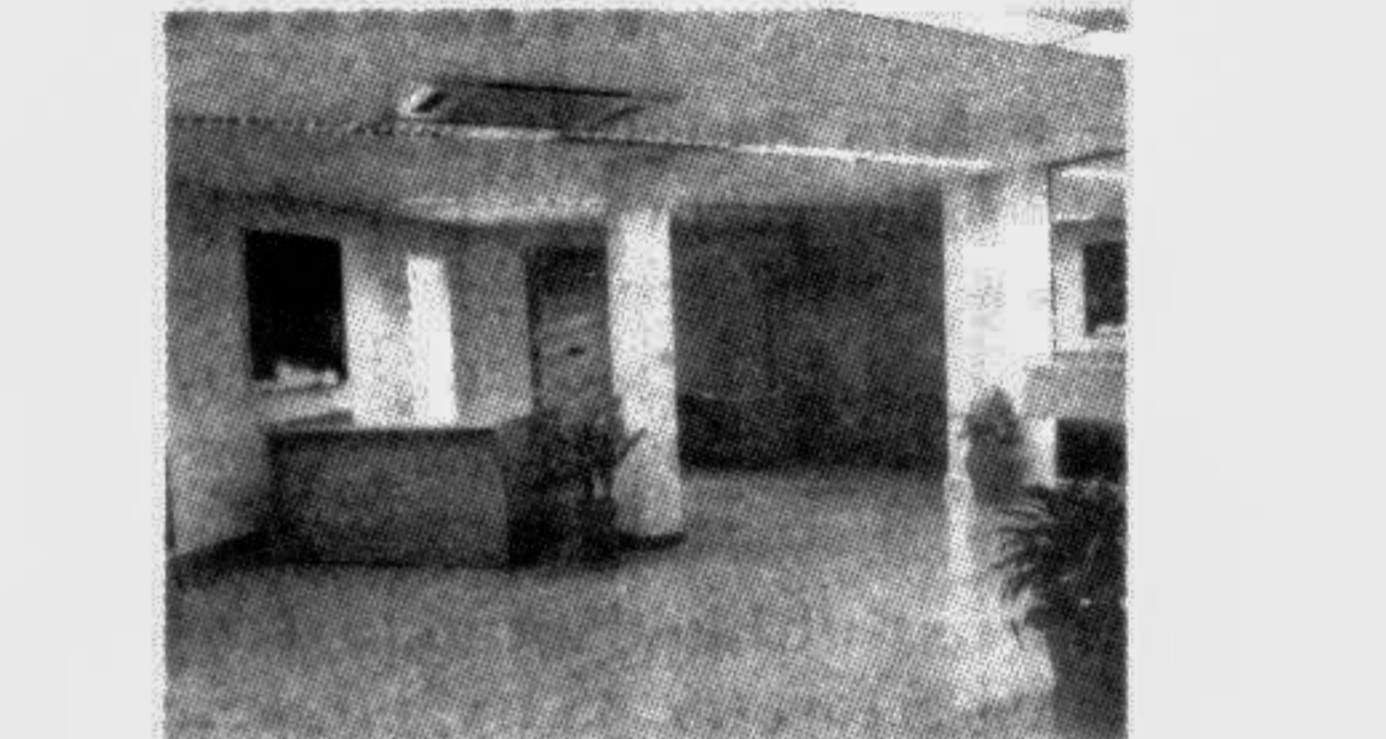
Faster, efficient transactions in comfort