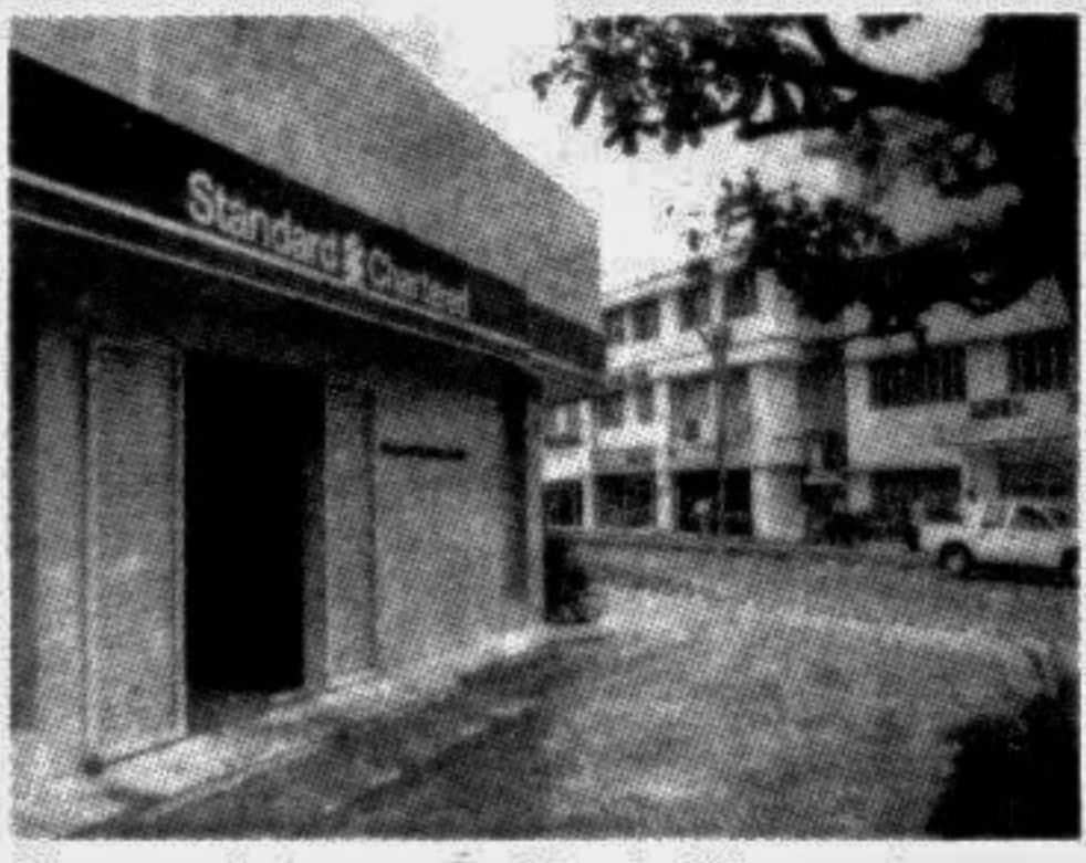
New premises, easy parking facilities