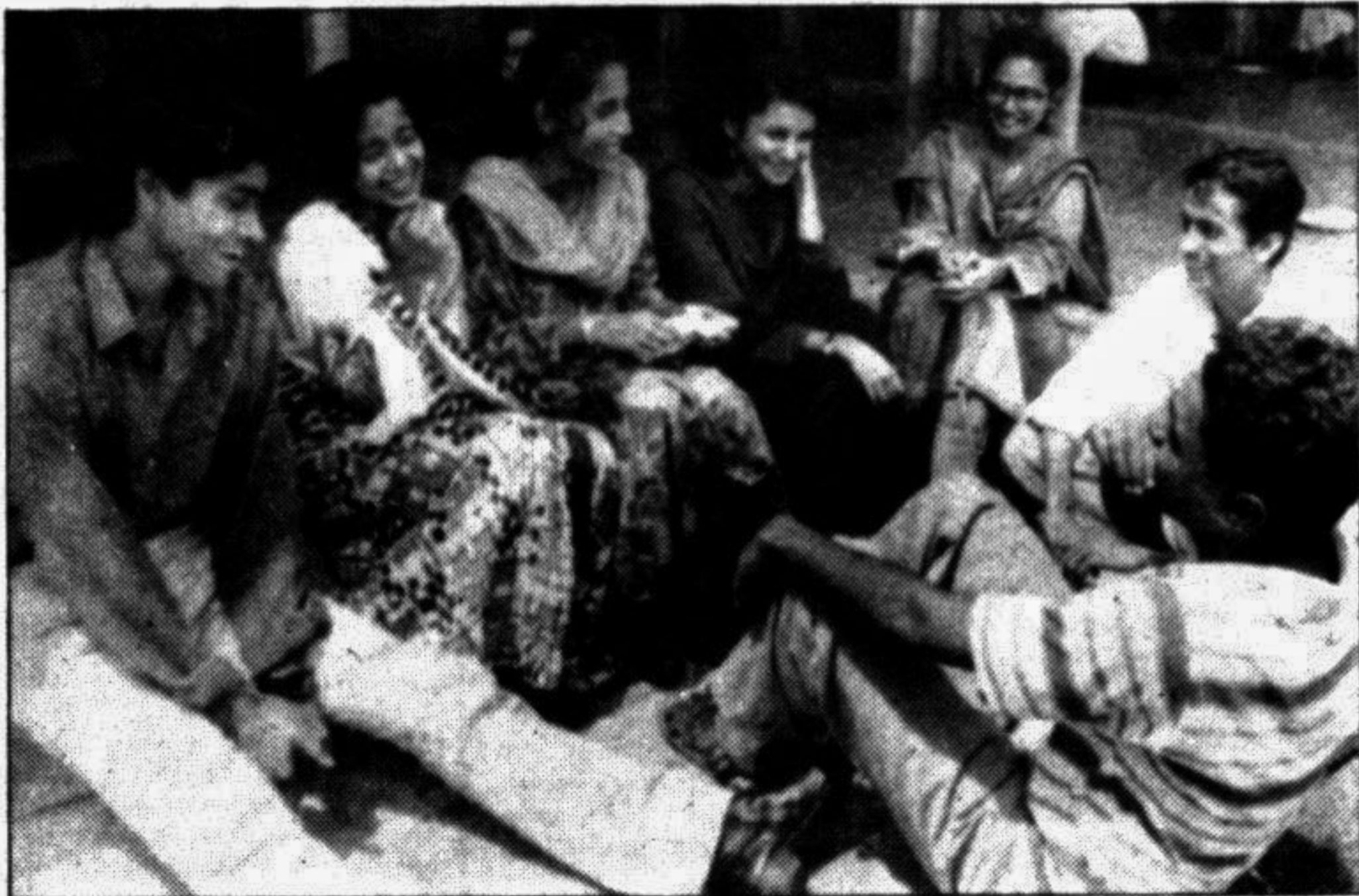
These addas are really the beginning of a life long friendship; yet many fail to recognize.

any chance they do, then I can be sure that they're definitely up to something. I didn't ask why she put her daughters and son in different kinds of schools, as the reason seemed too obvious. Then I tested the 'Head of