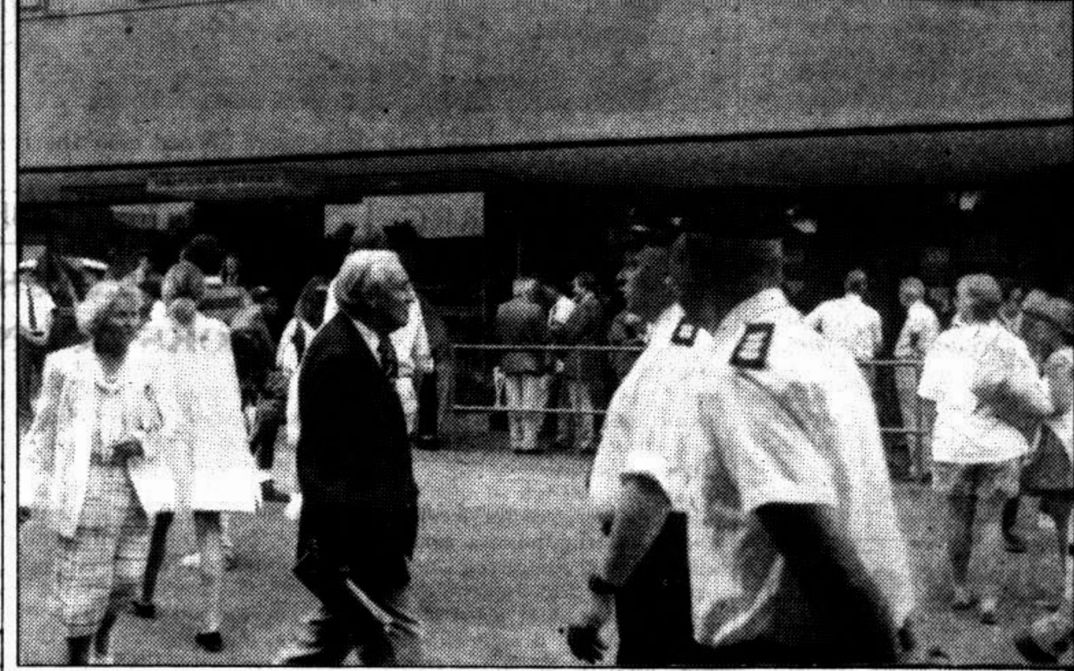
A partial view of the Wimbledon umpires' office.

in default — $ 5,000, c) For unsportsmanlike conduct, shouting 'shut up' to the crowd — $ 500. "This is the highest fine ever imposed for on court offences at the championships. The previous highest was to John McEnroe in 1991 — $10,000 for verbal abuse." But McEnroe must have forgotten it when he strongly condemned Tarango