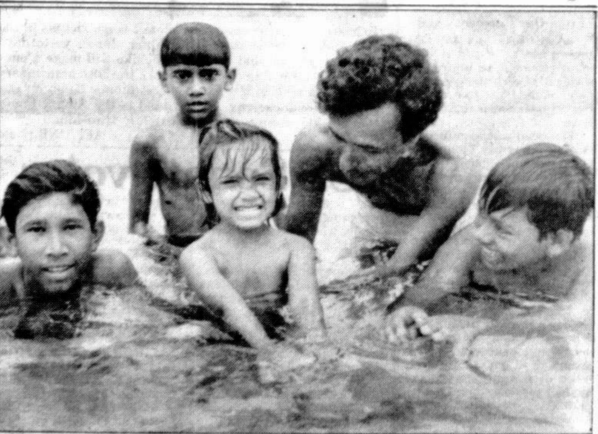
The little nutants, who are now undergoing training at the Mosharraf Swimming Centre adjacent to the Dhaka Stadium, enthusiastically display their new-found talent. The picture was taken yesterday.

Edberg has now won 751 career matches, which is more than any active player on Tour. The Swede said he doesn't pay much attention to those milestones, but that sometimes,