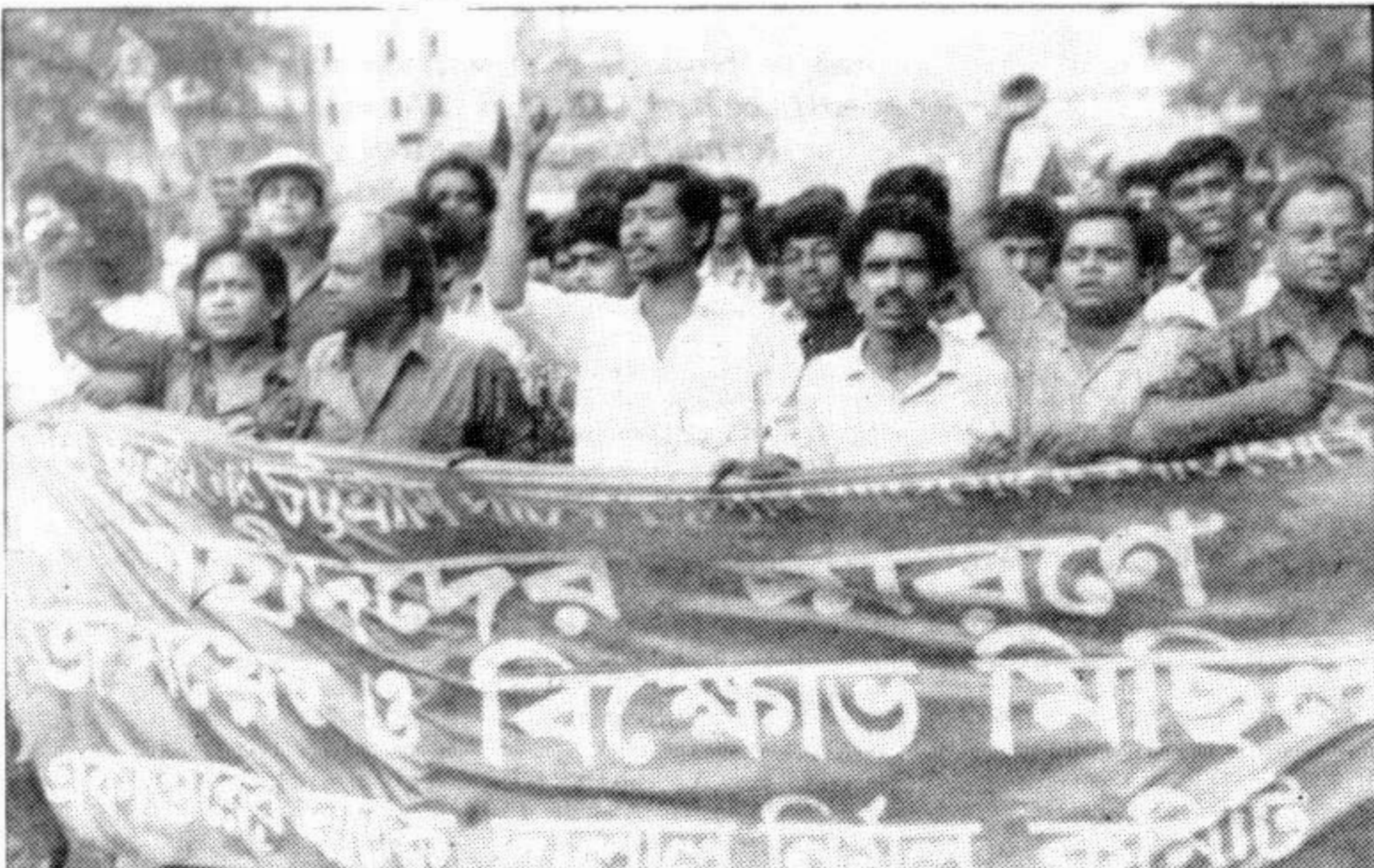
The Ghatak Dalal Nirmul Committee brought out a procession in the city yesterday to commemorate those who died this day last year in Chittagong during a resistance programme against the arrival of Jamaat chief Golam Azam in the port city.

Some angry students also damaged at least ten buses during the demonstration.