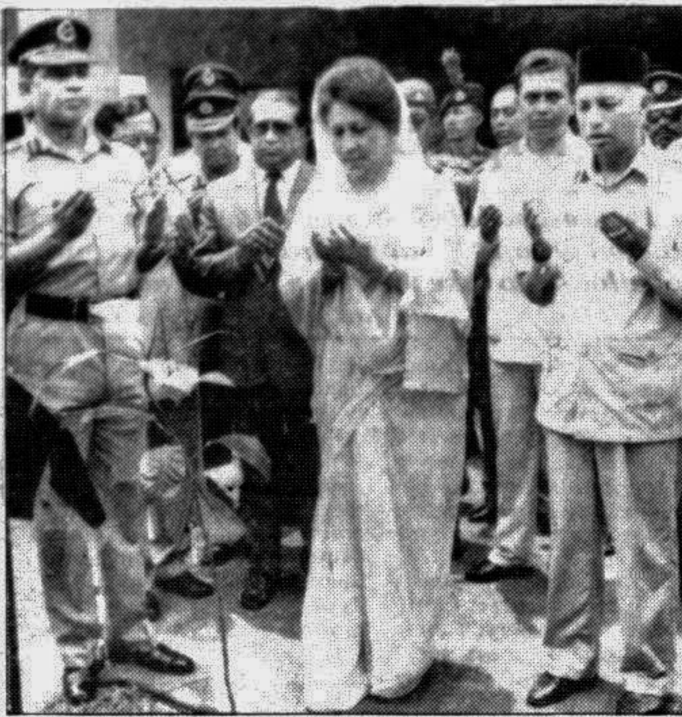
Prime Minister Begum Khaleda Zia inaugurated the tree plantation programme of Bangladesh Police by planting a sapling at the Police Headquarters in the city yesterday.

common instrument of entertainment. Some observers, however, harbour misgivings about the adverse influence of the fast spreading phenomenon, since much of the shows projected through satellite channels indicate preponderance of sex and violence. That is perhaps the inevitable price that has to be paid for technological advance.