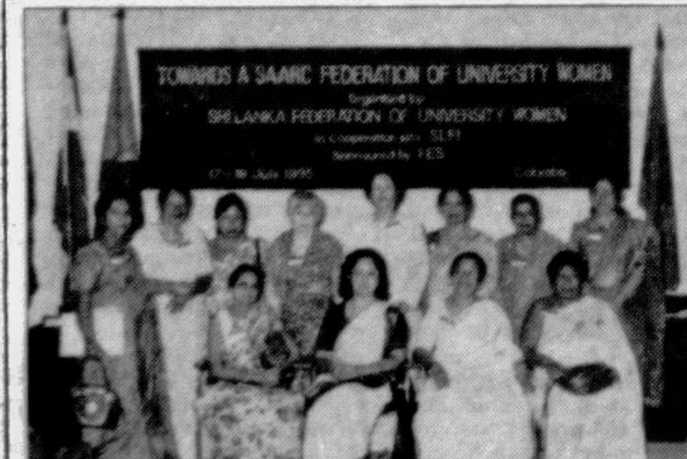
Participants at the recent SAARCFUW meeting in Colombo in Sri Lanka.

Commonwealth heads of government on the basis of the report will finalise the fate of Cameroon to join the Auckland summit, said a press release.