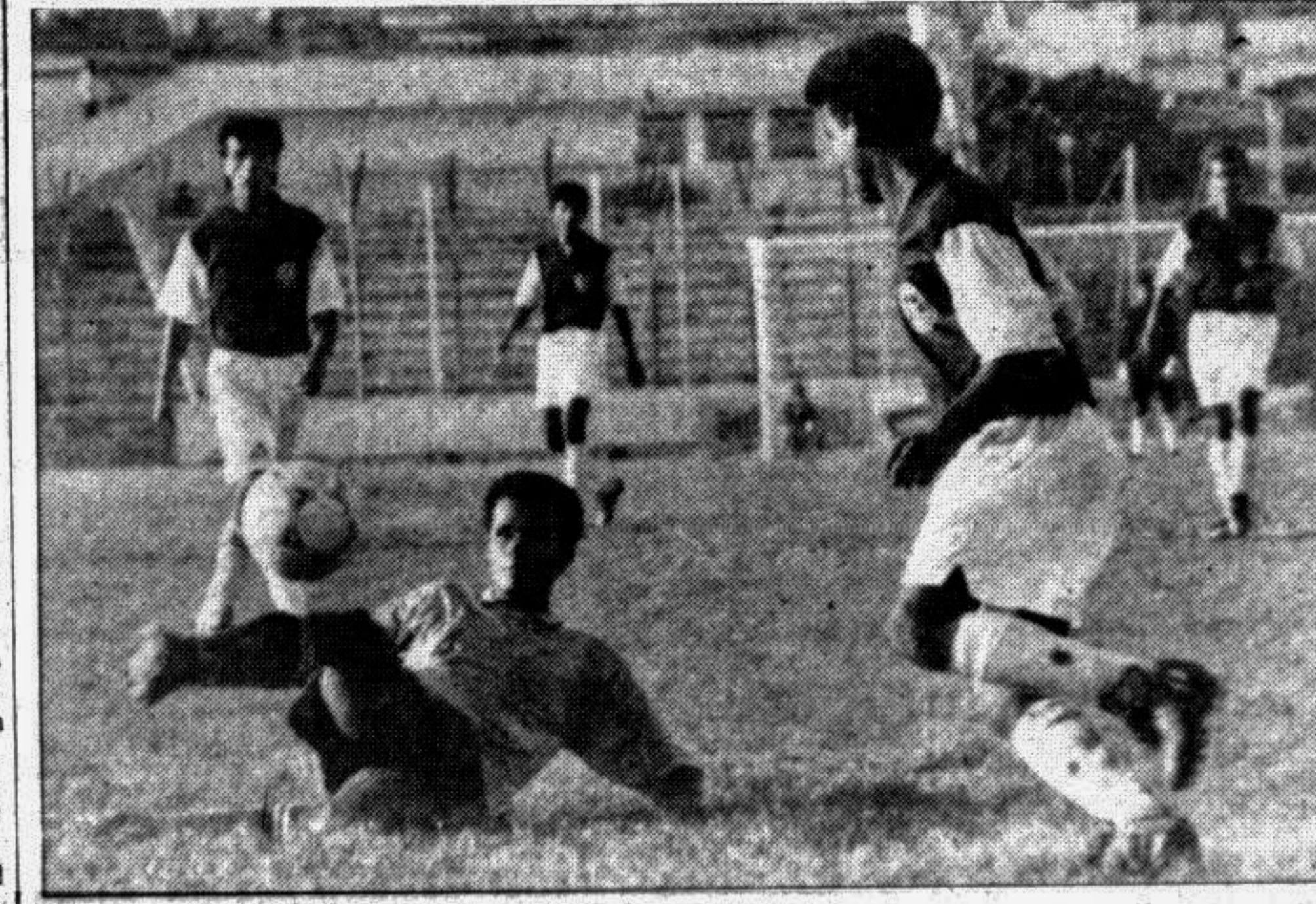
Action from yesterday's Lifebuoy First Division football league encounter between PWD SC and Sadharan Bima KS at the Dhaka Stadium. PWD won 3-0.

On the Monday, when the British team was announced for Gothenburg, Jackson was told he had seven days to prove his fitness to be included. After a testing training session, he pulled out last Friday. "I don't blame the BAF for being injured, but I blame them for putting pressure on me to prove my fitness," the Welshman, 28, said. "I needed time to calm down and get myself right. If there hadn't been this pressure, I feel I would be going to Gothenburg. I could have won the gold medal again. "My big mistake was not speaking to someone from the federation in Birmingham. But I was not prepared for what I had to take. Jackson visits his doctor in Germany Monday.