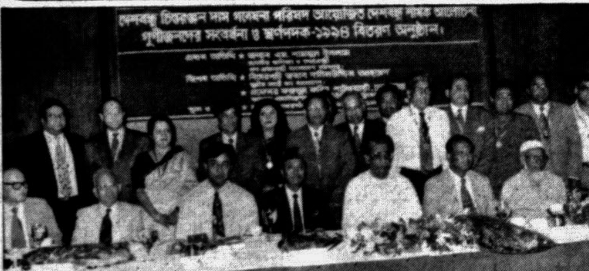
Recipients of Desbandu Chittaranjan Das Gold Medal are seen with the Commerce and Information Minister M Shamsul Islam (sitting, 3rd right) at a ceremony at a local hotel recently.