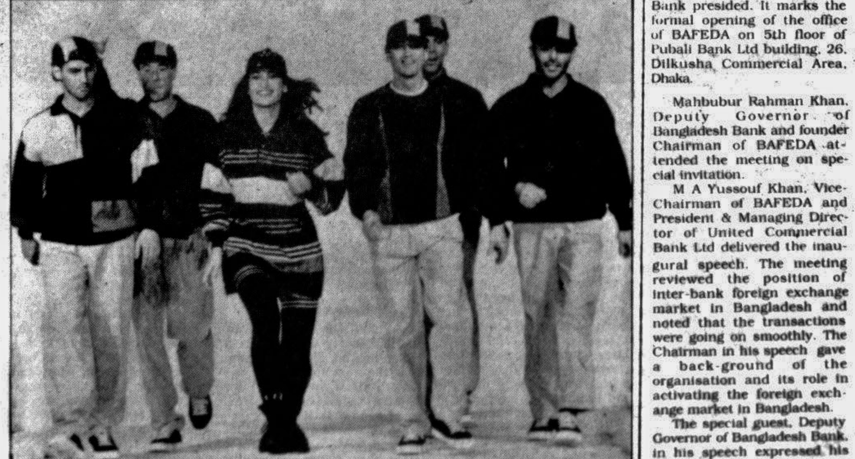
Bangladesh continued to register a dynamic profile at the International Men'swear Fair in Cologne, an event now come to be regarded as 'the heartbeat of the fashion world'.