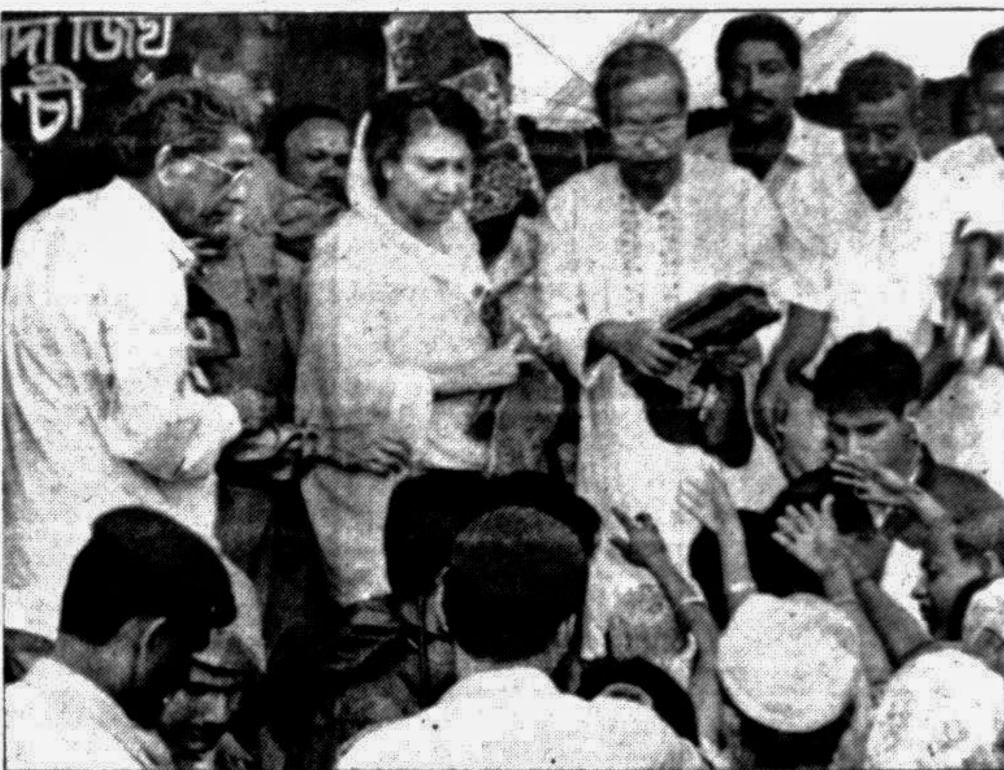
Prime Minister Begum Khaleda Zia distributing relief goods among the flood-affected people at Louhaganj Bazar of Munshiganj district yesterday. Deputy Leader of the House Prof A Q M Badruddoza Chowdhury and Information & Commerce Minister M Shamsul Islam are also seen.

An expert suggested that acquisition of 'community experience' should be made mandatory for any one pursuing higher medical education. If this is done as a policy, medics will be able to contribute to development of community health, the expert observed.