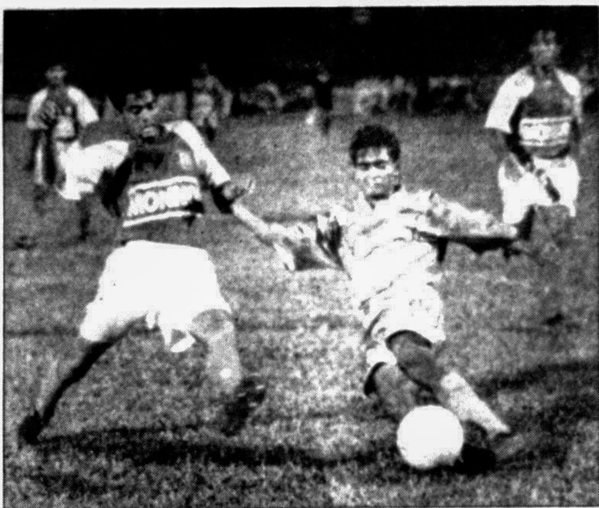
Action from yesterday's Lifebuoy Premier Division match between Abahani Krira Chakra and Wari Club at the Dhaka Stadium. Abahani won the match 3-0.