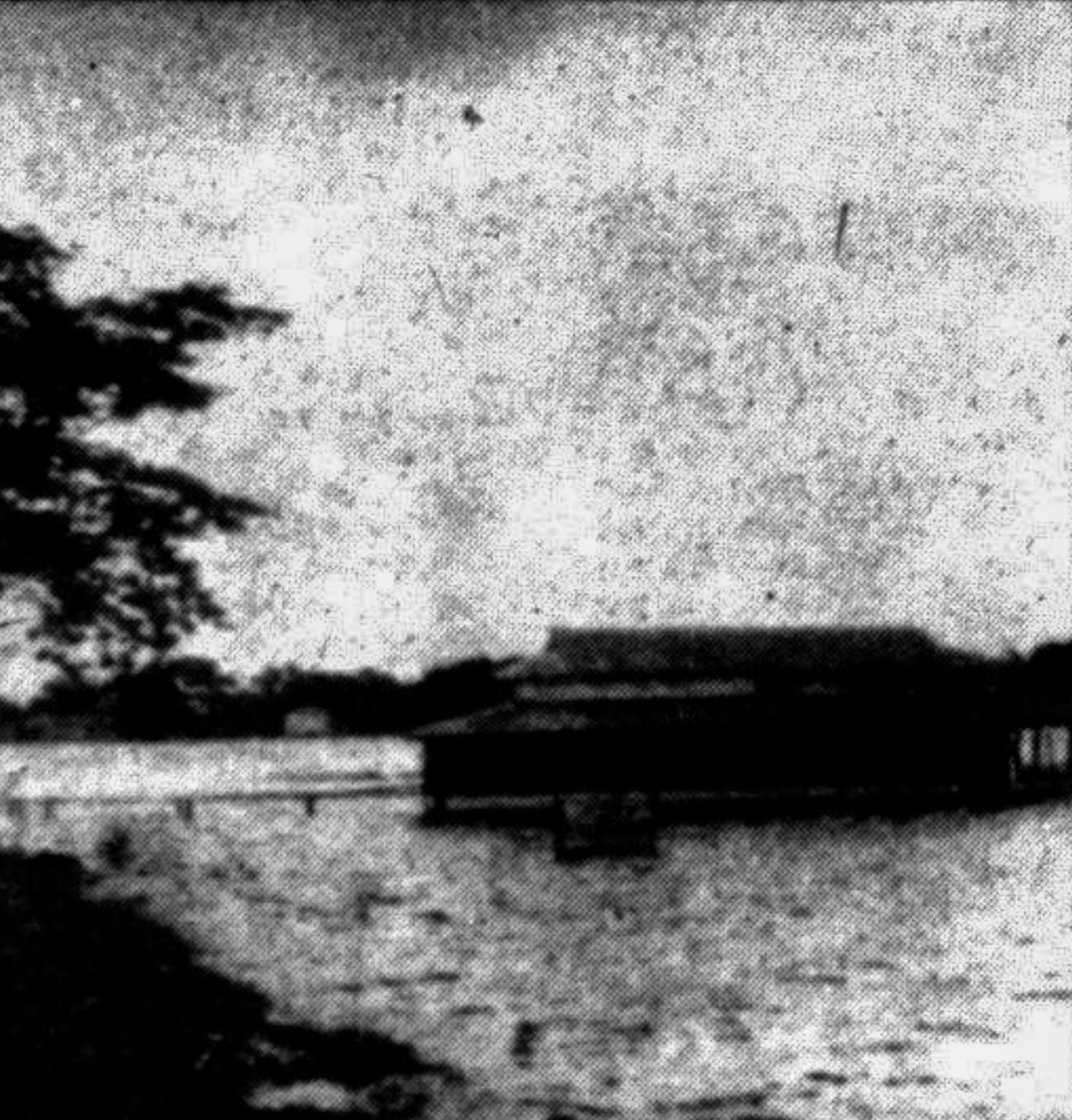
NARAYANGANJ: Dhaka-Chittagong highway is under threat of inundation of flood water has almost reached the road.

According to district administration sources, about 50,000 people belonging to 6,000 families of district have been affected. Over 7,000 houses have been fully damaged and 3,725 houses were partially damaged. A total of 17 kilometres of road have gone under water, while 36 kilometres of road have been partially marooned. Flood waters have so far damaged, fully or partially, about 91 educational institutions including 18 high schools and 73 primary schools, 40 bridges and culverts. Official sources said, standing crops, including Aus, Aman, jute and vegetables on about 12,798 acres of land have been totally damaged and crops on about 12,662 acres were partially damaged. District fisheries department sources said, about 11 hatcheries and about 69 fish-beds worth about Taka 1.53 crore were washed away by flood waters. At least 14 people were killed in flood related incidents in different unions in Arahazar, Bandar, Sonargaon, and Siddhirganj thanas during last one week, the concerned thanas informed. Meanwhile, government