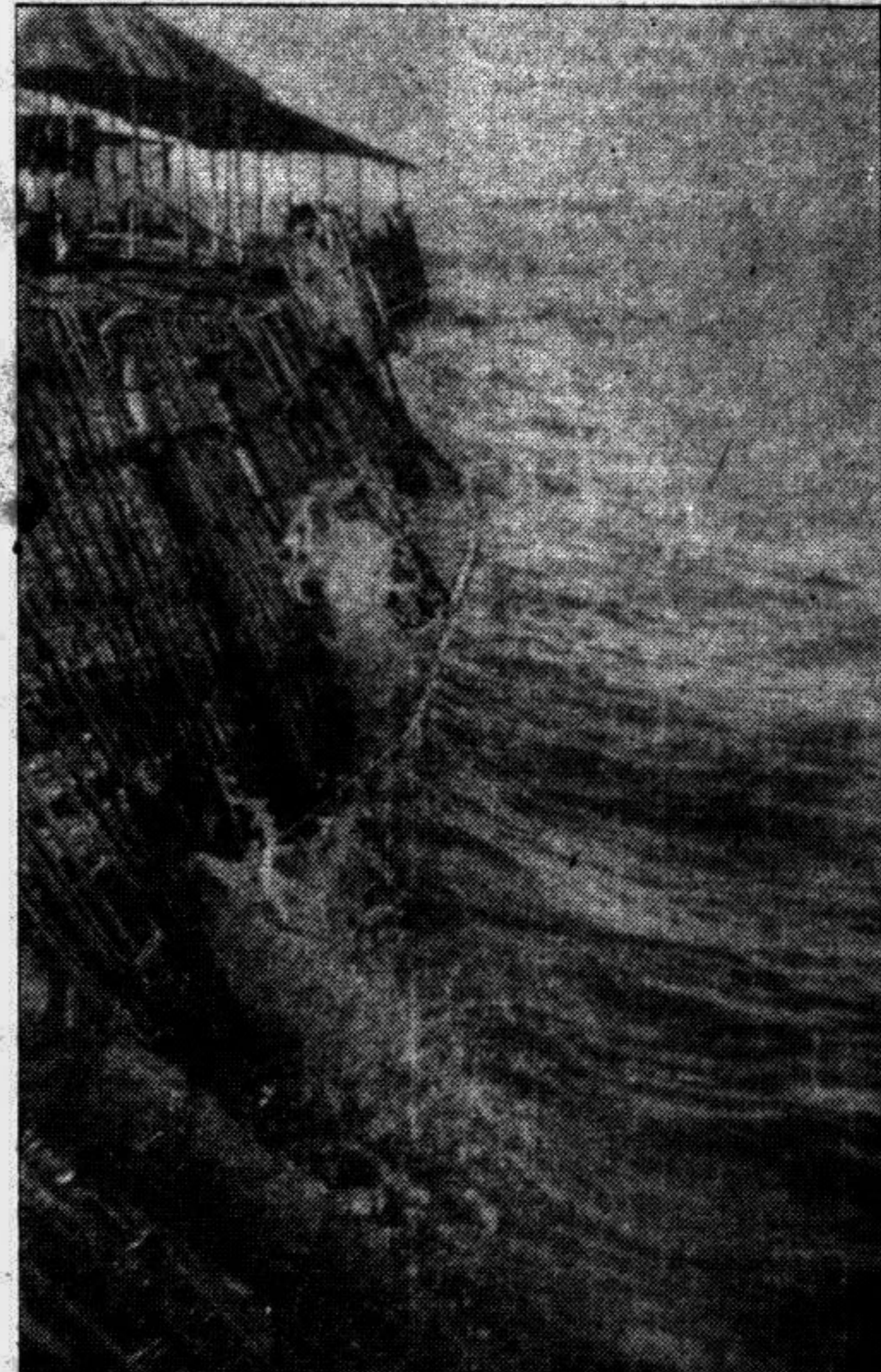
NATORE: Bilsha Bazar of Gurudaspur thana is now under threat of being washed away at any time by the turbulent waters of Chalan Beel.

According to a report, during the last century, flood occurred in Chalan Beel areas about 14 times. Among the 14 floods most devastating one was in 1988. But due