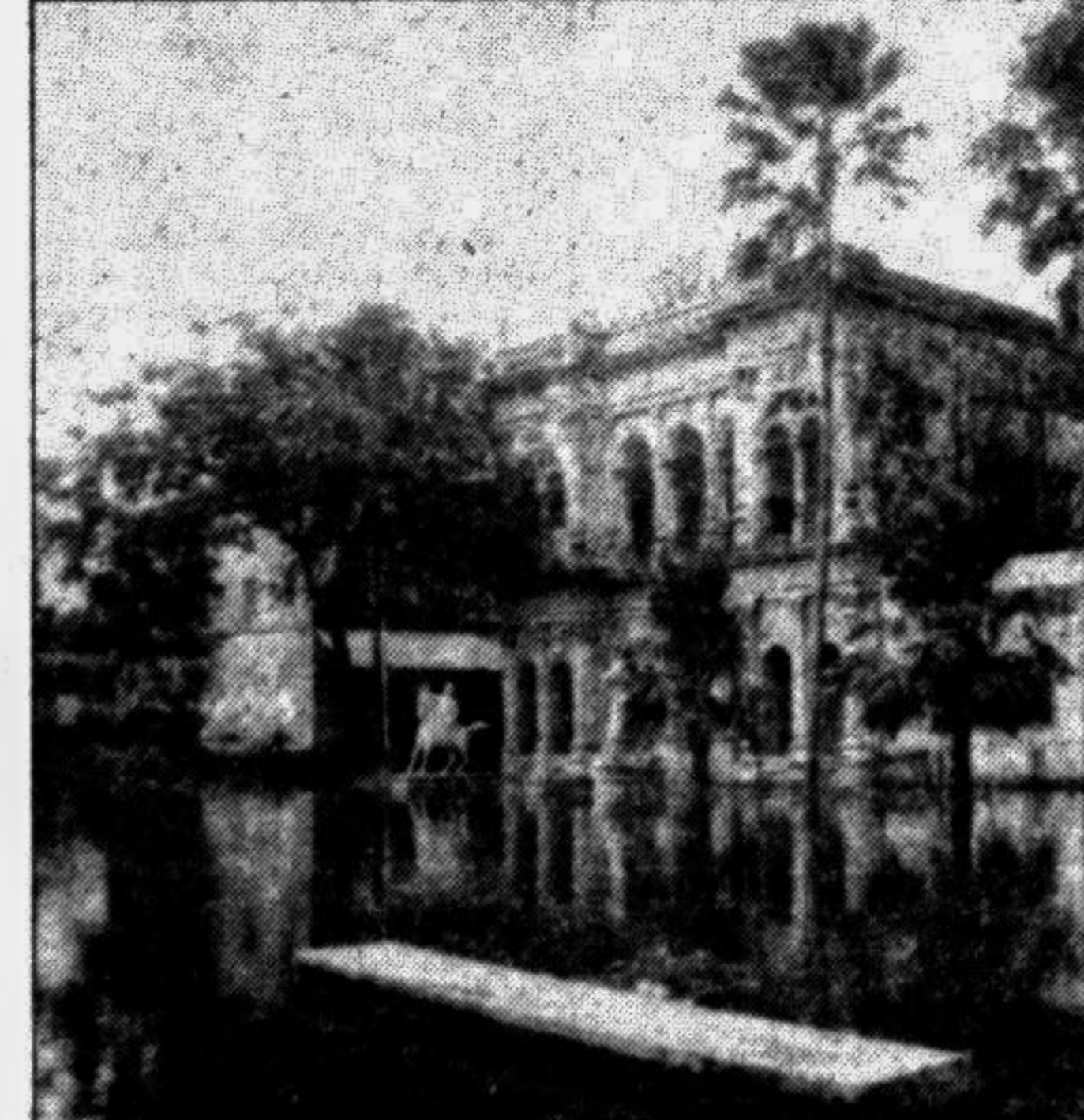
NARAYANGANJ: The premises folk museum at Sonargaon is inundated by flood waters.

at Zangalia village under Bandar thana. To protect the Adamjee Jute Mills from flood waters the mills authorities took some steps. The Folk Museum at Sonargaon is under threat as two breaches have developed in Narayanganj-Narsingdi Agrani Irrigation project embankment. Local people stopped