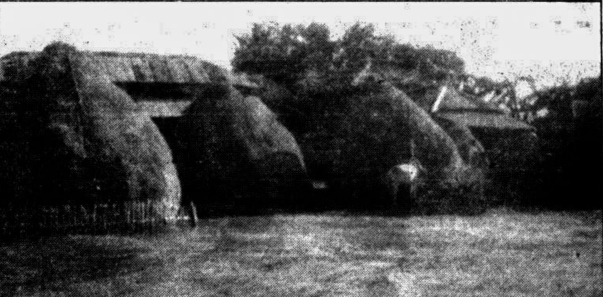
NATORE: Flood waters inundated many dwellings in the area surrounding the Chalan Beel.

NATORE, July 21: Chalan Beel, the vast beel of the country is now in the grip of flood. About 10 lakh people are inundated. Fresh areas are being inundated in eight thanas of Chalan Beel almost everyday as the water level of the beel is continuing to rise alarmingly, it was gathered while this correspondent had been visiting the beel areas last Friday, Saturday and Sunday.