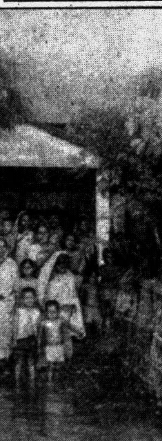
NARAYANGANJ: Some 150 flood-hit families have taken shelter in the Deobag Hazi Uzir Ali High School under sader thana.

Official sources said, standing crops, including Aus, Aman, jute and vegetables on about 12,798 acres of land have been totally damaged and crops on about 12,662 acres were partially damaged. District fisheries department sources said, about 11 hatcheries and about 69 fish-beds worth about Taka 1.53 crore were washed away by flood waters.