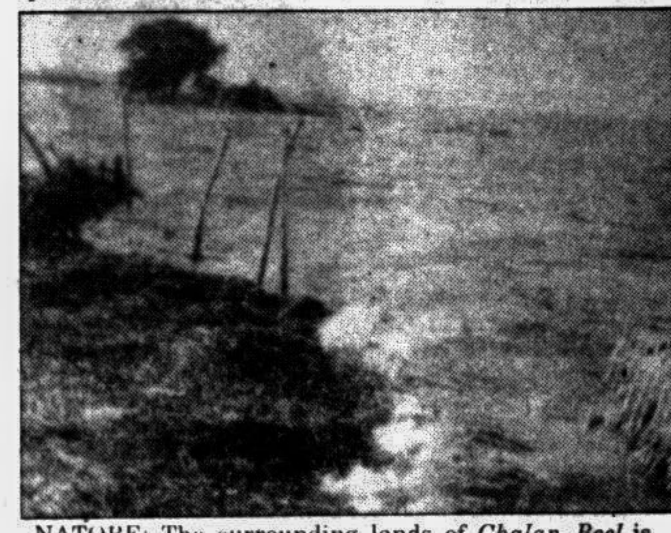
NATORE: The surrounding lands of Chalan Beel is under threat of inundation.