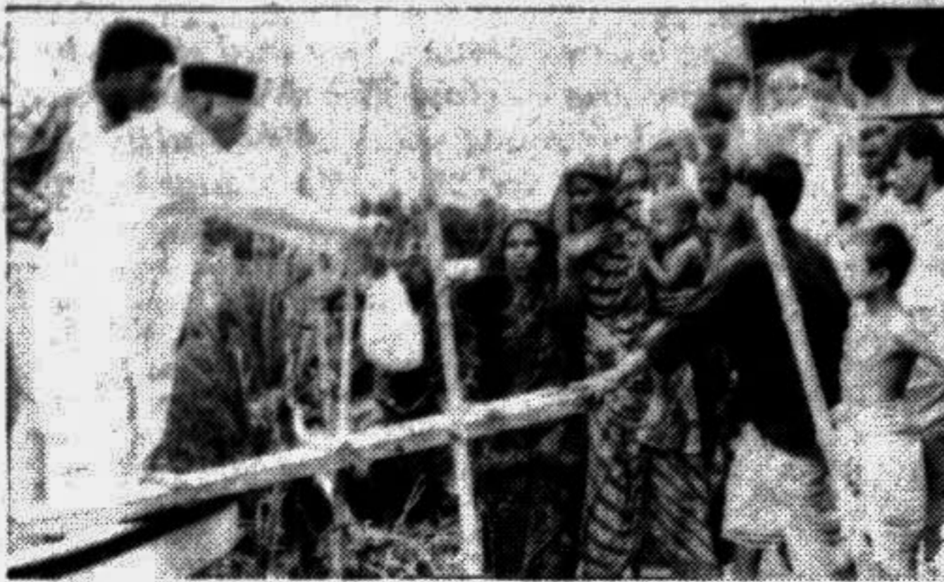
Home Minister Abdul Matin Chowdhury distributing relief materials among the flood-hit people of Rupganj Thana in Narayanganj district yesterday.

We still don't know if it's safe for a woman to go out at night. But, within reasonable limits, we're ready to take the risk. What we do know is this — it's a wonderful and liberating feeling. It's great to be on a rickshaw at night with the hood down, the chattering lights of Dhaka all around you, and some distant tune floating past. Adjust your pulse, wave to the other women on Mirpur Road, and look up at the sky. Ah, what a beautiful night it is!