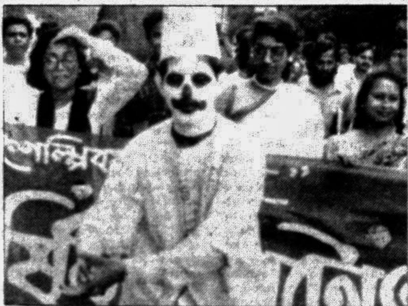
The Theatre Art, a drama group, brought out a colourful rally on the occasion of its founding anniversary in the city yesterday.

Some district governors, past dist governors of other districts and Lions greeted the newly elected governor in the function.