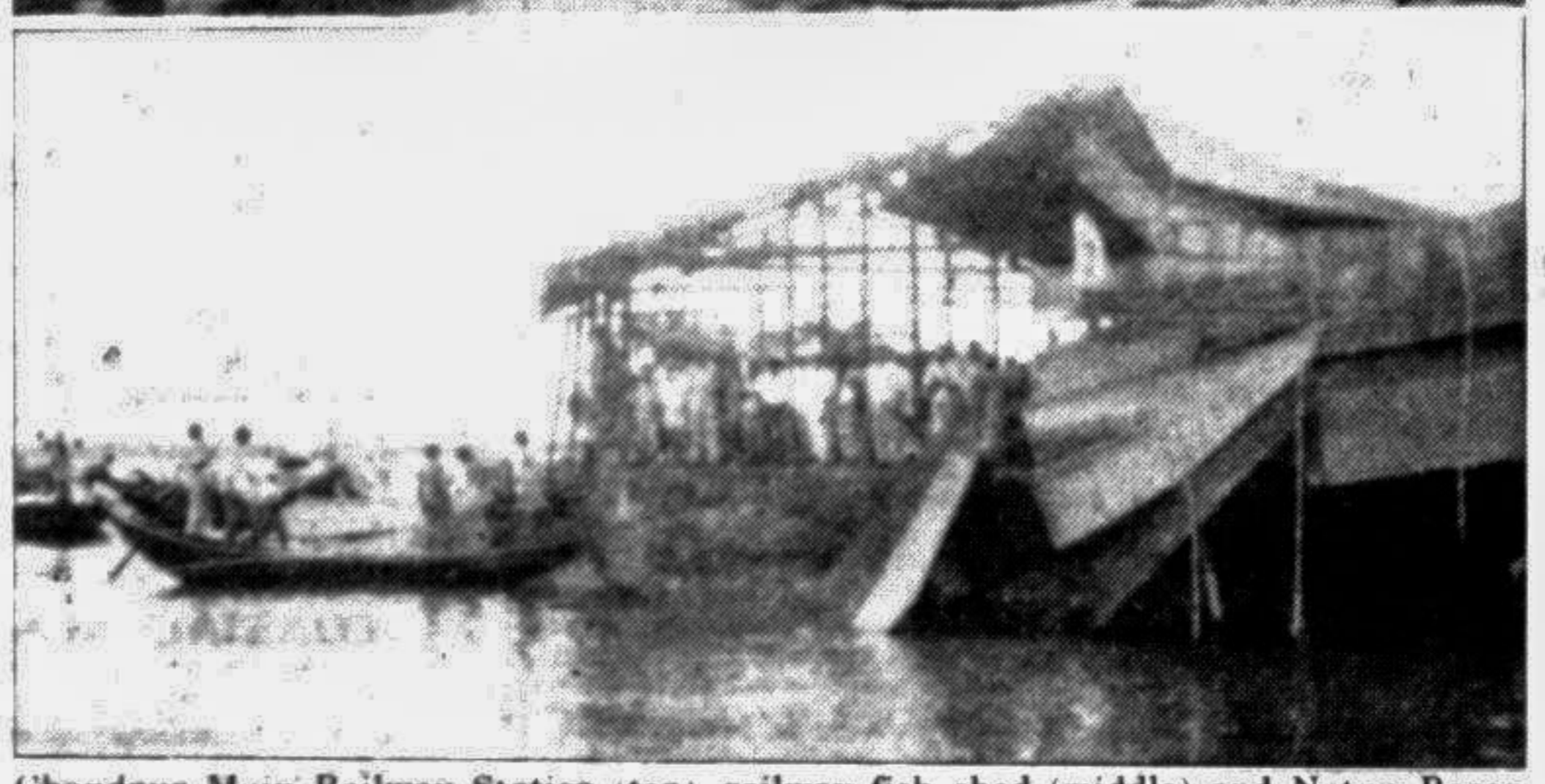
Chandpur Main Railway Station (top), railway fish shed (middle) and Natun Bazar (bottom) were partially devoured by the Meghna yesterday.