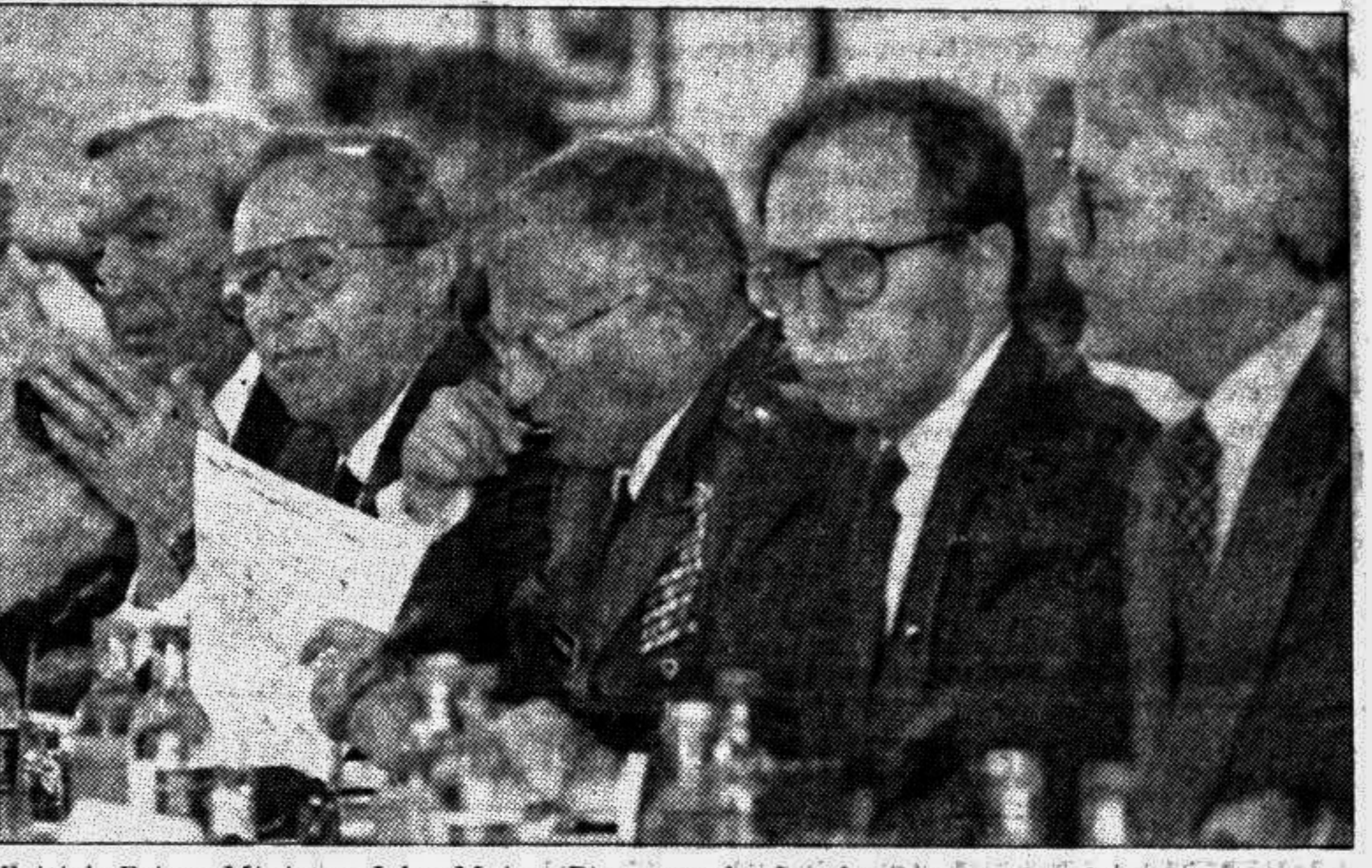
British Prime Minister John Major (R) opens the London international conference on Bosnia at Cancaster House in UK yesterday, as American delegation headed by Secretary of State Warren Christopher (L) and Defence Secretary William Perry (2L) with Chief of Staff John Shalikashvili (C) listen. Major is flanked by British Foreign Secretary Malcolm Rifkin.

LONDON, July 21: Foreign Minister ASM Mostafizur Rahman said here today that Bangladesh wanted a negotiated settlement in Bosnia on the basis of UN contact group's peace plan, reports BSS. He at the same time said "But, Bosnian Serbs will not negotiate unless peace". See page 12 Col 4