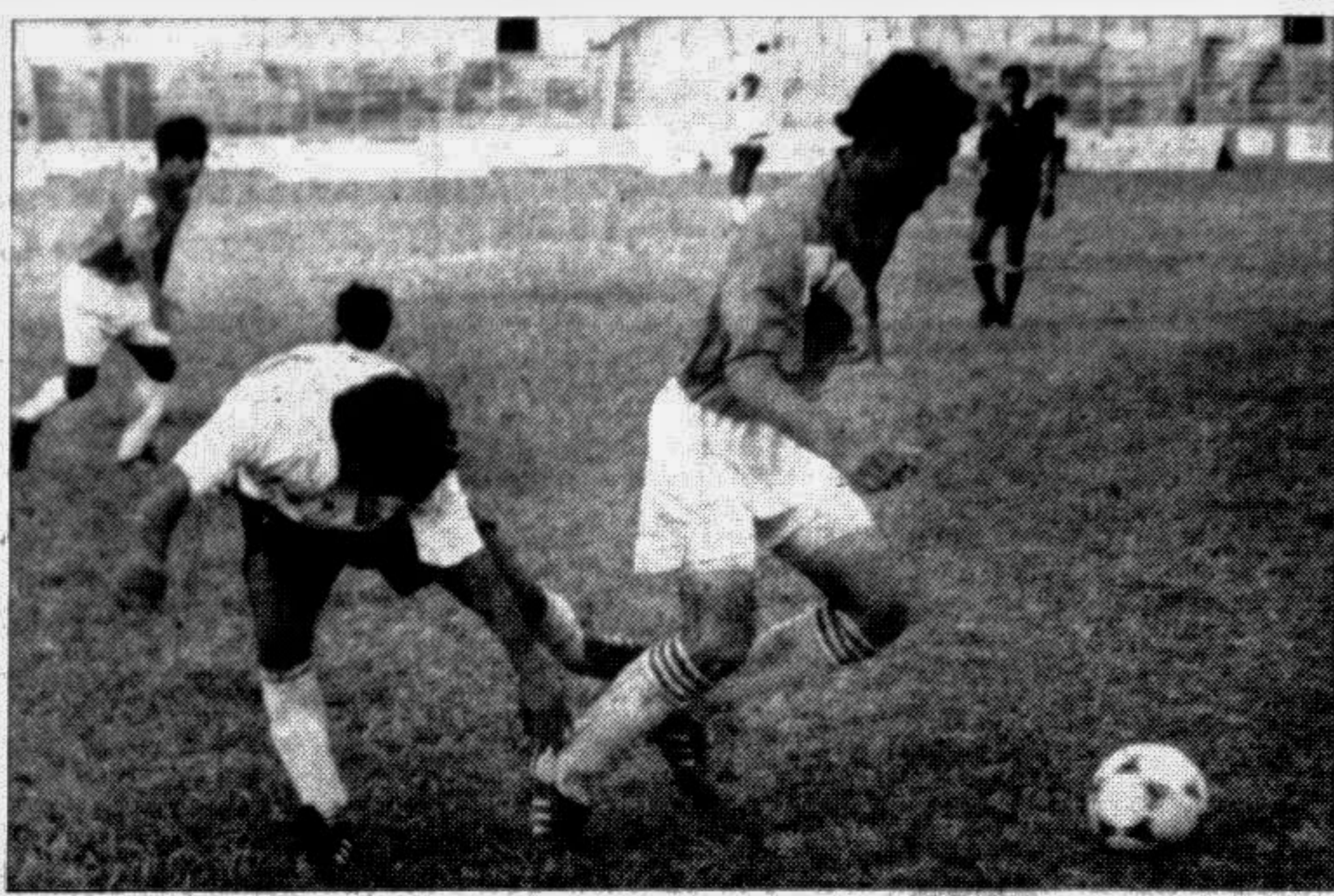
Action from yesterday's Lifebuoy First Division football league encounter between Badda Jagorani and Eskaton Sabuj Sangha at the Dhaka Stadium. Badda Jagorani won 1-0.