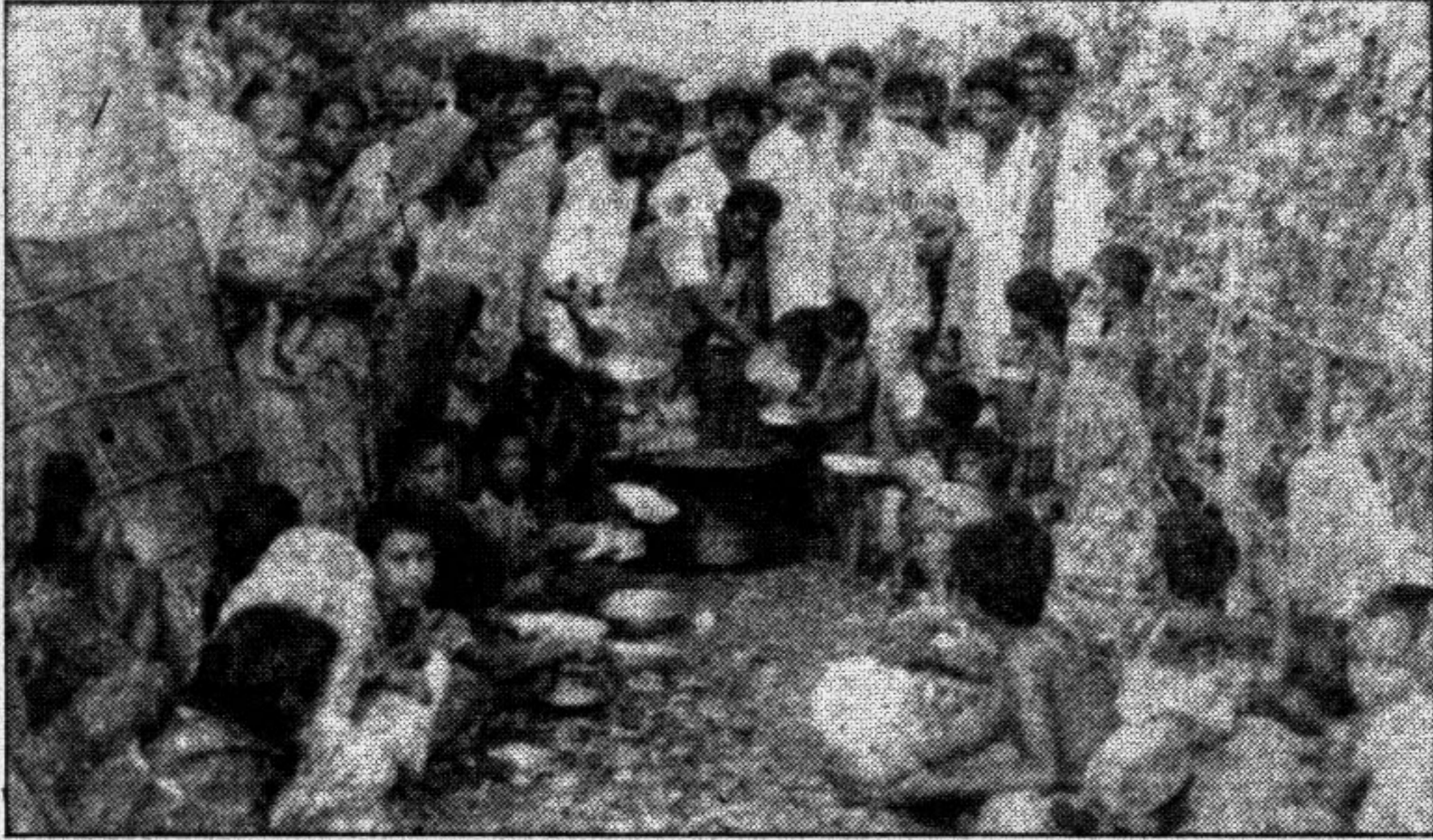
CHANDPUR: Pourashava authority distributing cooked food among flood victims at Railway Akkas Ali High School.