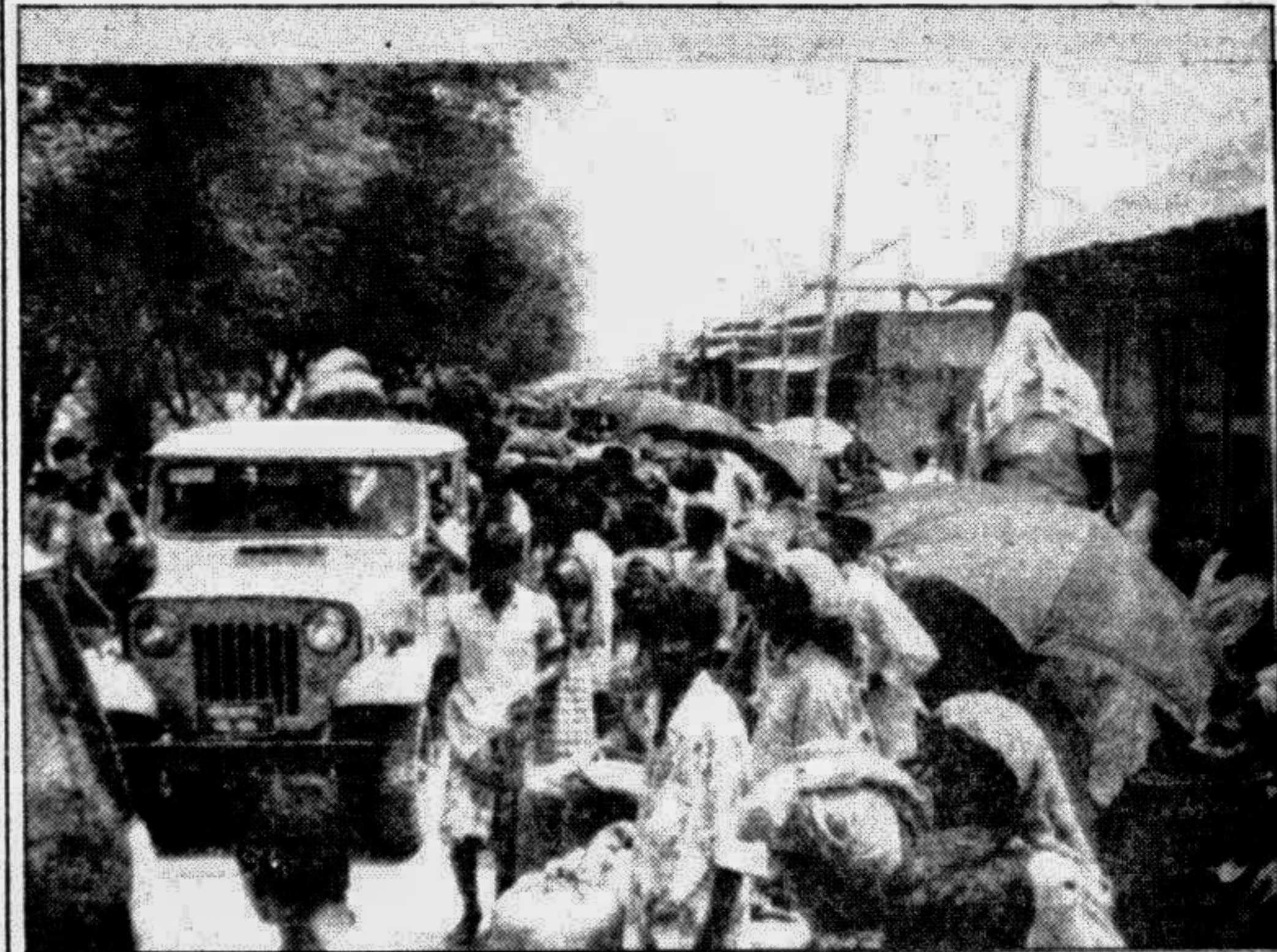
PABNA: Flood affected people in the worst hit Bera thana of the district surrounded the vehicle carrying the Deputy Commissioner and some journalists while they were visiting the areas. Most of the people believed that the vehicle was carrying relief for them.