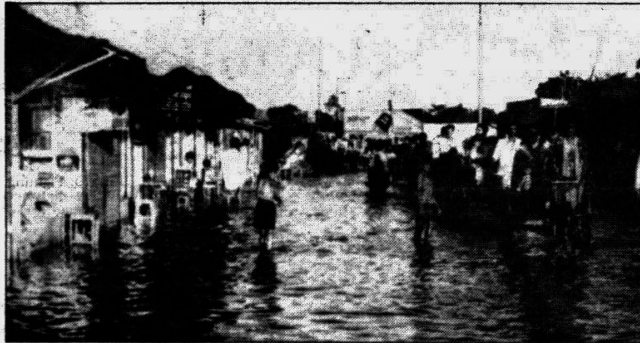
CHANDPUR: Flood waters marooned the Chandpur-Comilla road of the town.

CHANDPUR, July 19: The flood situation in Chandpur district is improving gradually. The Meghna river at Chandpur is still flowing 50 centimetres above of danger level. Seven more unions in the district were submerged raising the total number of affected unions to 57 in the district. So far five people were killed by flood, according to unofficial sources.