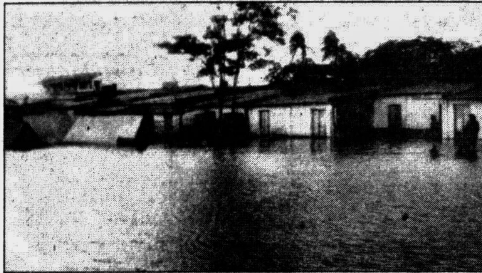
CHANDPUR: Nazirpara area of the town is completely inundated.