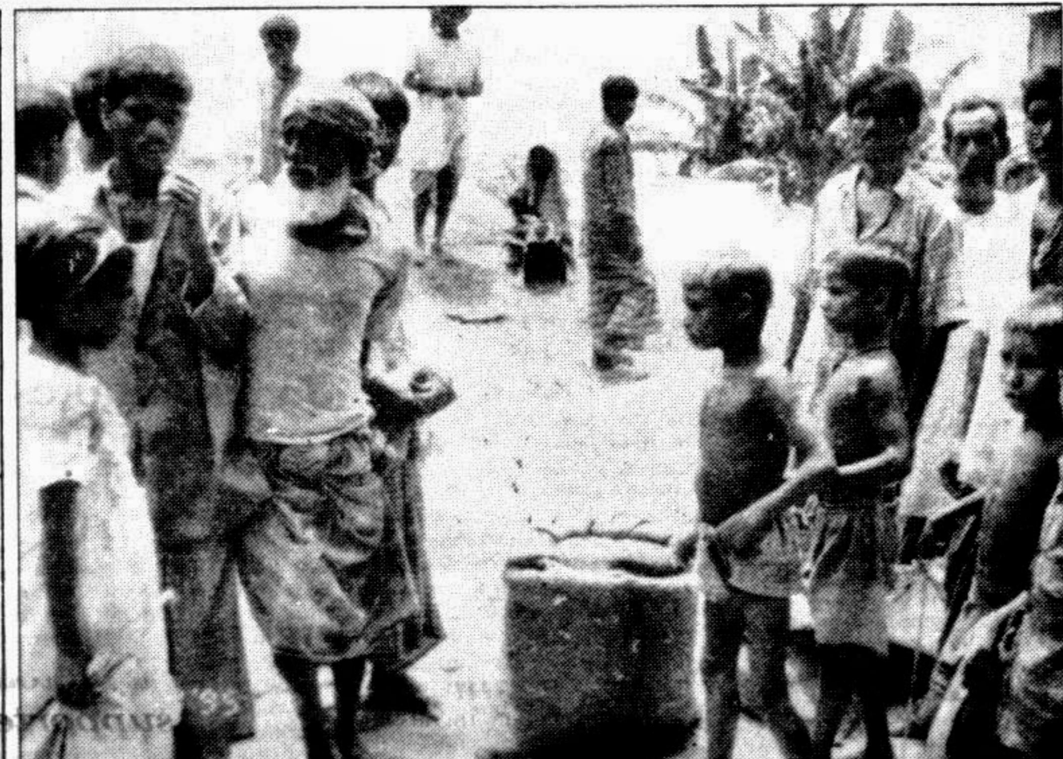
PABNA: A few flood victims who could save their produce — peanuts were seen on an embankment in Haturia-Nakalia. Unfortunately, they could not attract attention of any customer.