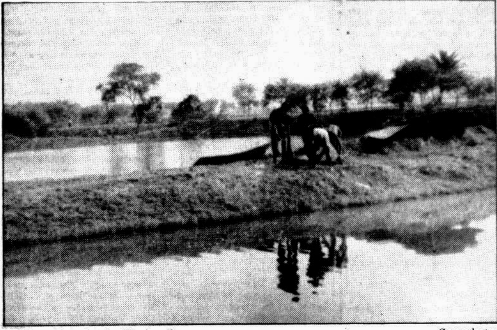
Picture of a gher in Khulna Zone

In the West, there is much discussion about the dual role that women have to play be-