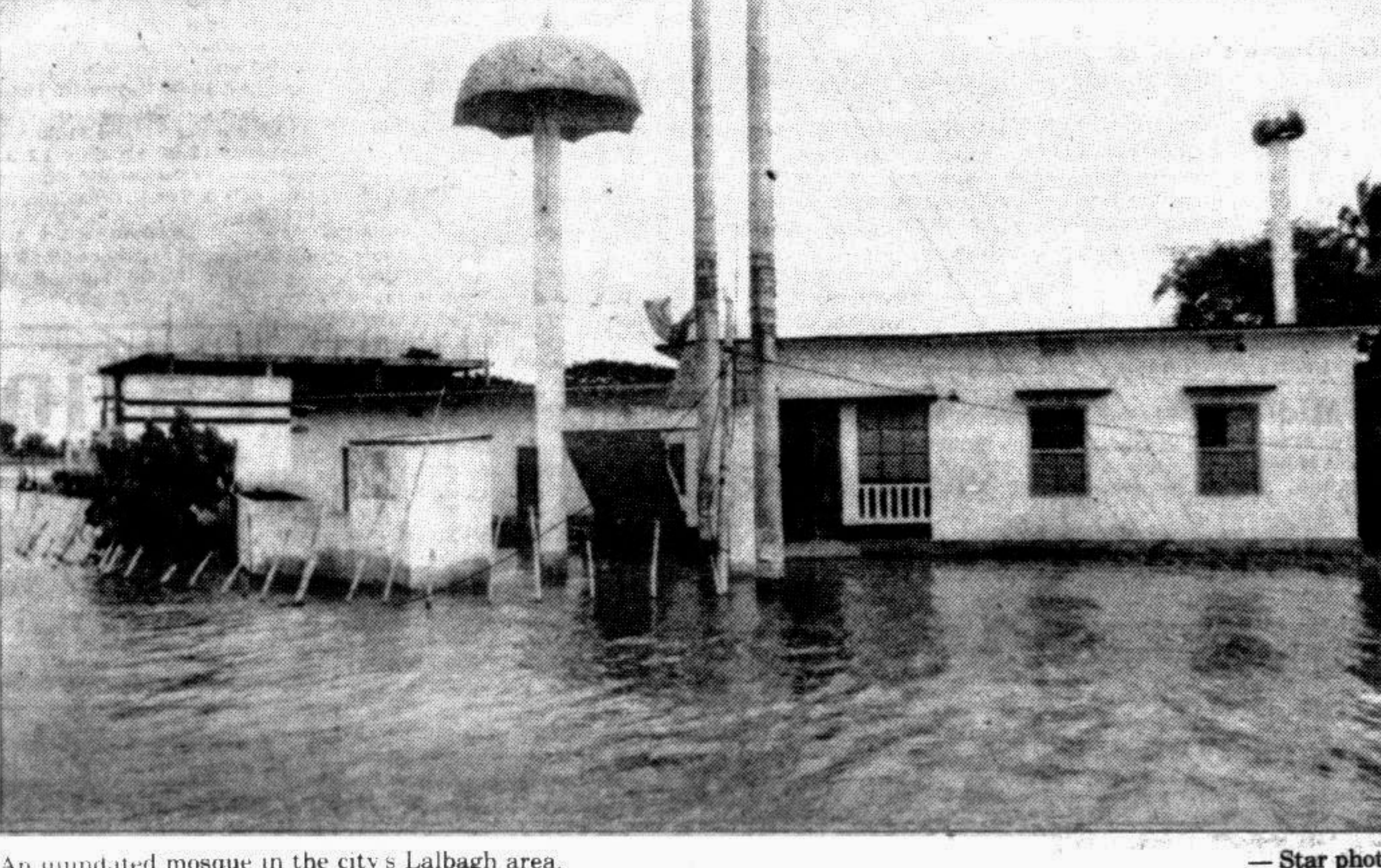
An inundated mosque in the city's Lalbagh area.

From Staff Correspondent CHITTAGONG, July 18: At least 50 people including 17 police personnel were injured in pitched battles between police and activists of the Pahari Chhatra Parishad today at Khagrachhari town. Official sources here claimed that one police inspector and a constable were in critical condition in hospital. The trouble began at around 1 pm when police tried to remove road barricades put up by activists of the Pahari Chhatra Parishad at Khagrachhari town and at Guimara in the district. PCP activists enforced the 8-hour barricades from the morning to press for release of their leader Pradipon Kisa, vice See page 12 Col 8