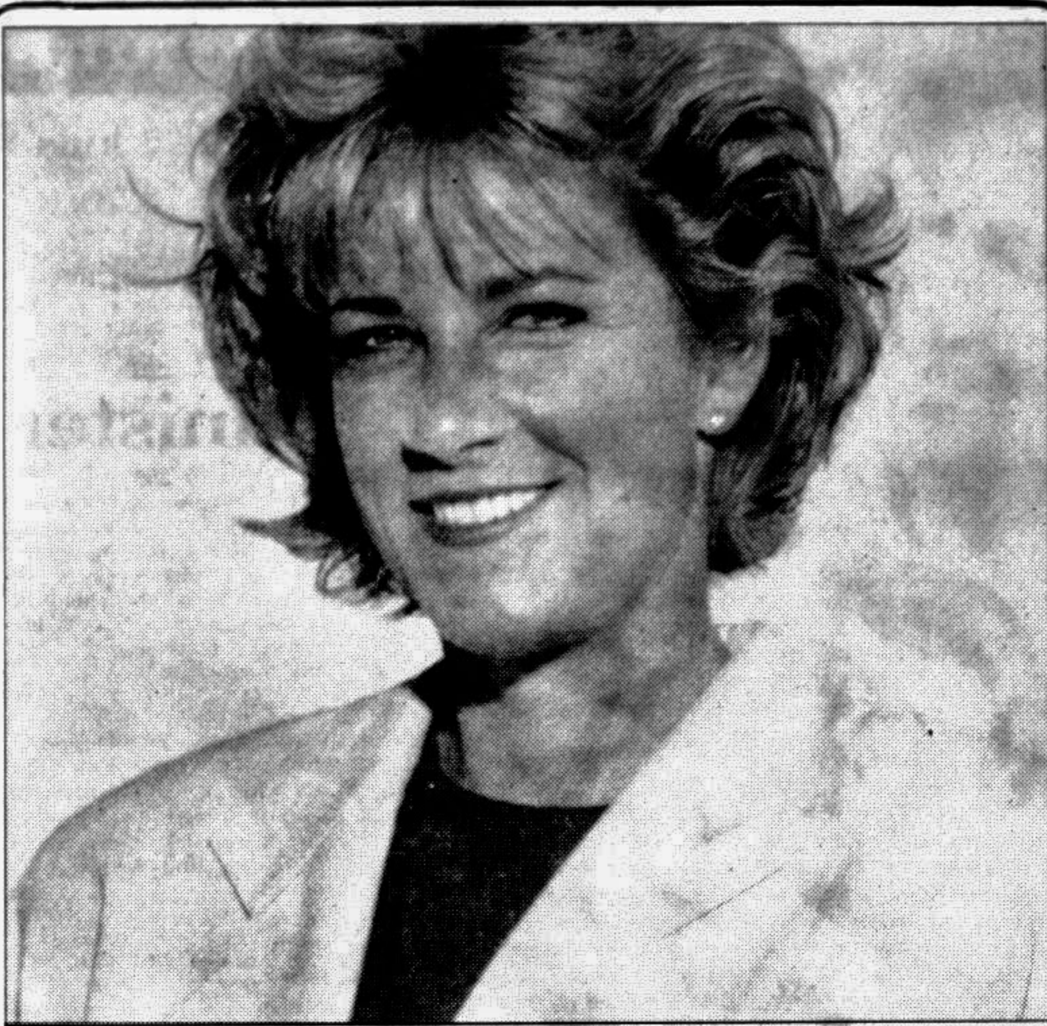
CHRIS EVERT ... joins elite club

SYDNEY, July 17: Incoming Australian Soccer Federation (ASF) chairman David Hill won an emphatic endorsement of his controversial rationalisation of the National Soccer League (NSL) at an extraordinary meeting of ASF stakeholders here Sunday, reports AFP.