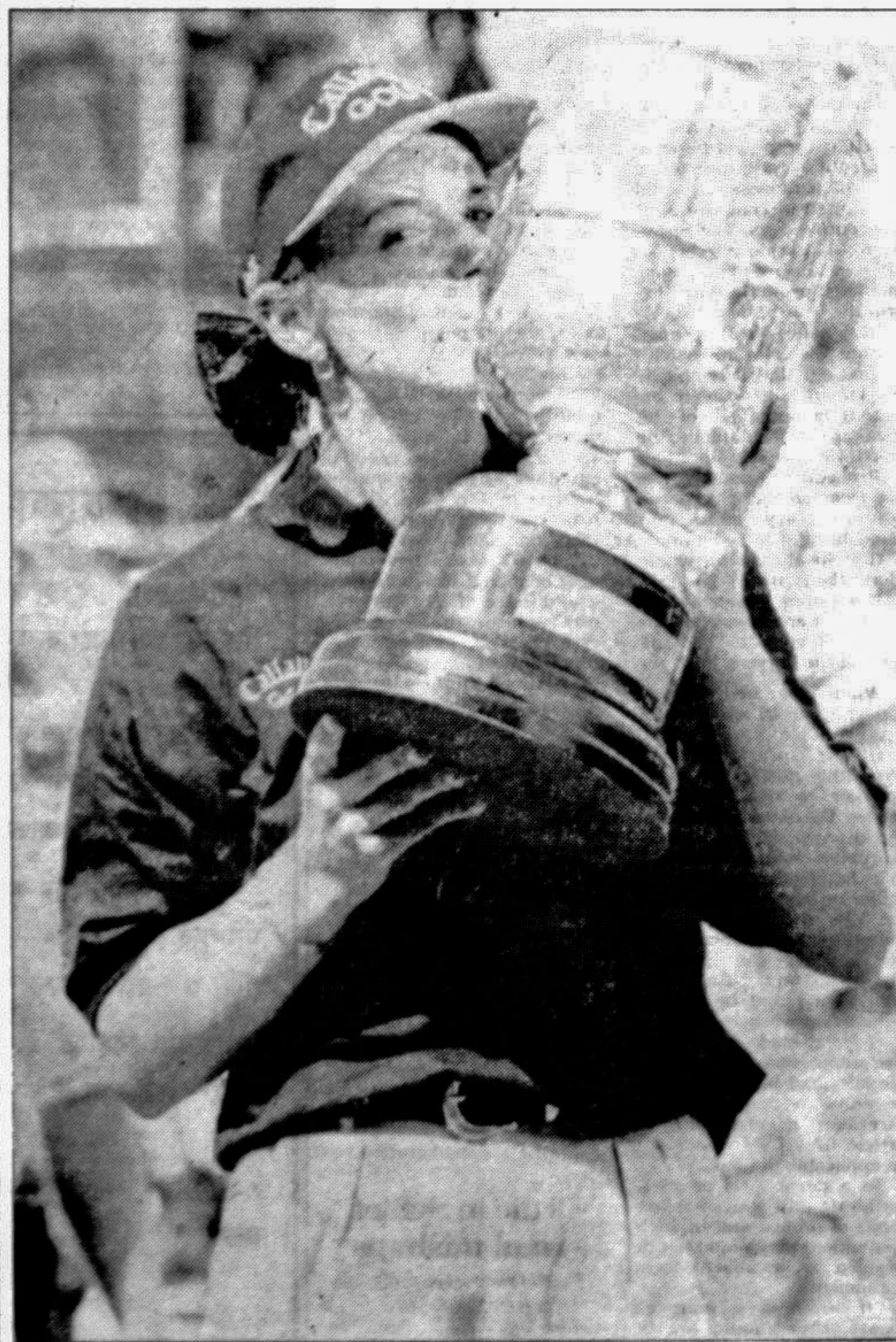
A jubilant Annika Sorenstam kisses the trophy in delight, to celebrate her victory in the US women's open golf championship at the Broadmoor Golf Club in Colorado, USA on July 16. Sorenstam finished at 2-under-par 278.

"But apparently it is another story if you want to take an honest look at China's methods."