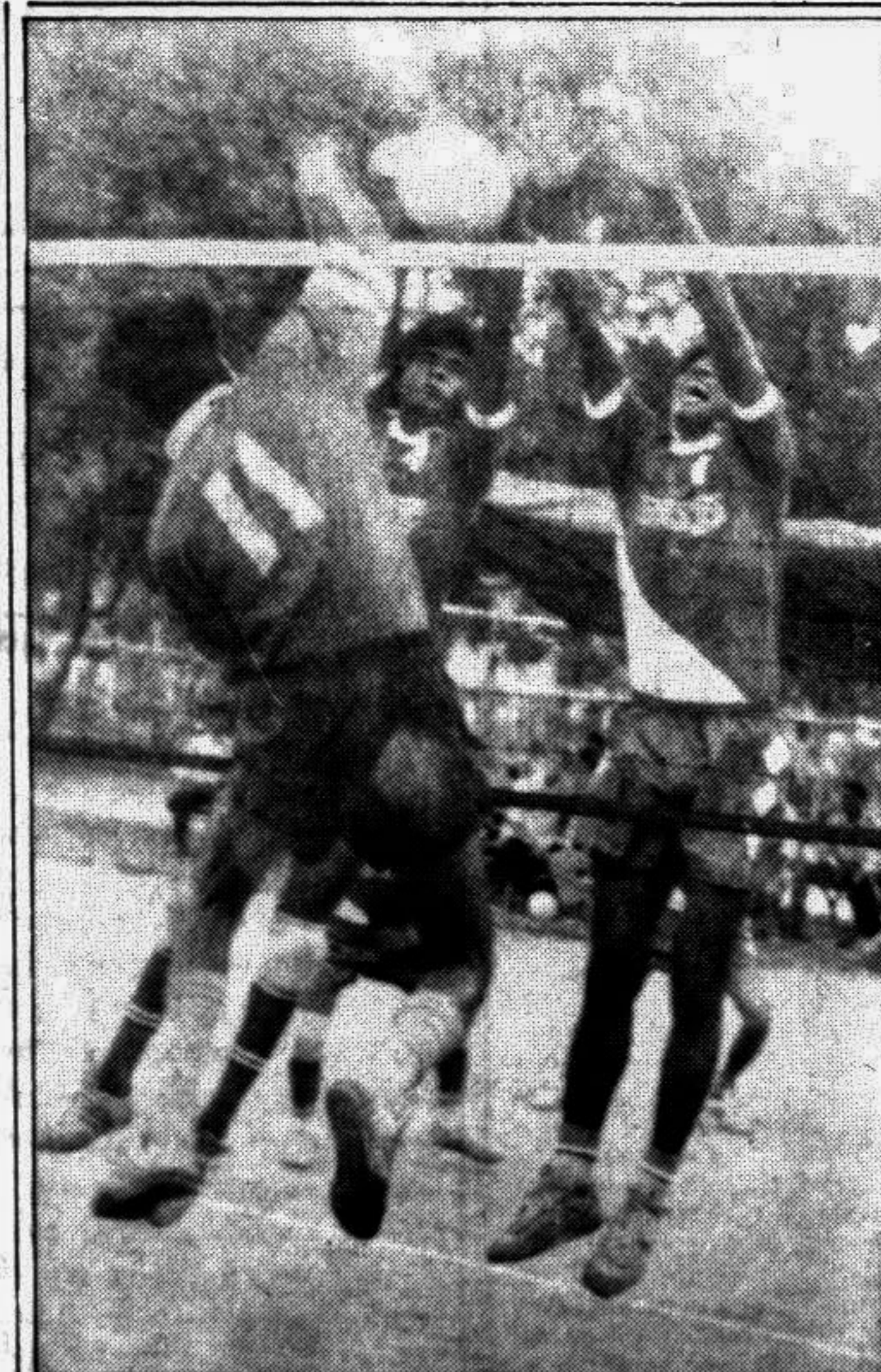
An unidentified Fire Service spiker smashes a ball during his sides NBL First Division volleyball league engagement against Dhaka Green at the Dhaka Stadium yesterday.

"I have in my hands one of the best players in the world, and one of the laziest as well," Luxemburgo said recently.