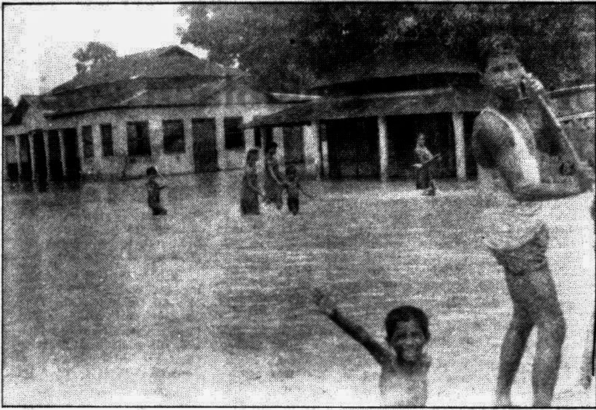
SHERPUR: Flood inundated Kamarer char Bazar. TDR office and post office are seen under knee-deep water.

Flood situation in Faridpur worsens FARIDPUR, July 17: Flood situation in the district worsened on Sunday, reports BSS. The Deputy Commissioner of Faridpur said that a large number of people of north channel union of sadar thana, Jhaukanda union of Char Bhadrason thana and Narkebaria union of Sadarpur thana were worst affected. Flood engulfed 14 unions under four thanas of this district. The DC said to cope with the scarcity of drinking water in the area arrangements have been made to distribute water purifying tablets. Faridpur sadar thana administration are supplying cooked food, molasses, and chira in the worst affected areas of north channel union. Meanwhile, govt has sanctioned two hundred metric tons of wheat, one hundred metric tons of rice and Tk two lakh for flood affected people of the district.