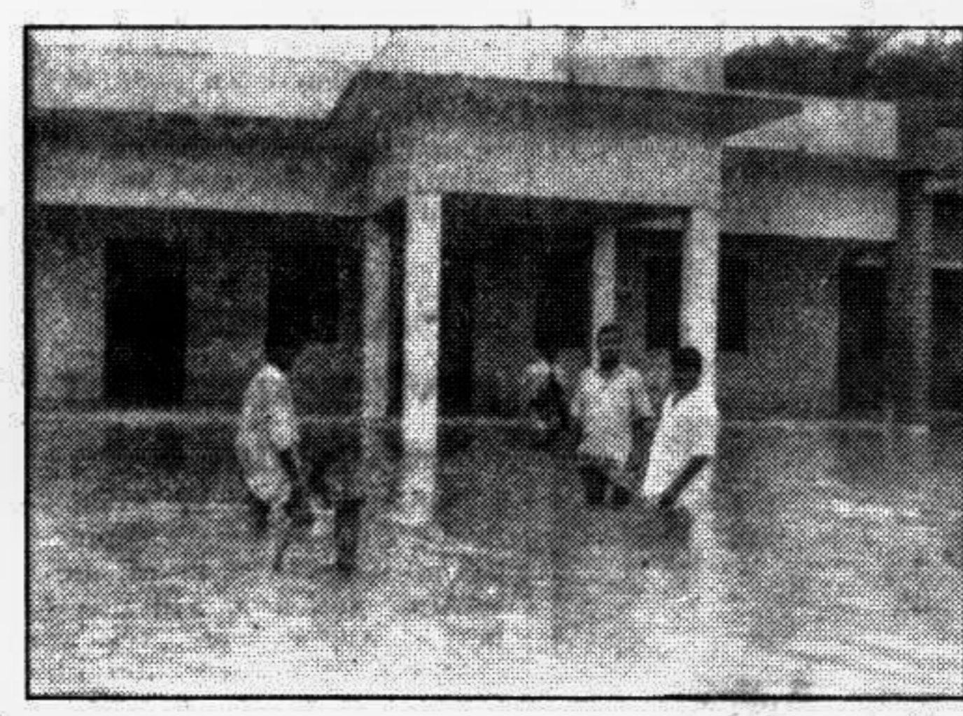
SHERPUR: Govt offices of the districts are marooned under three feet flood water.