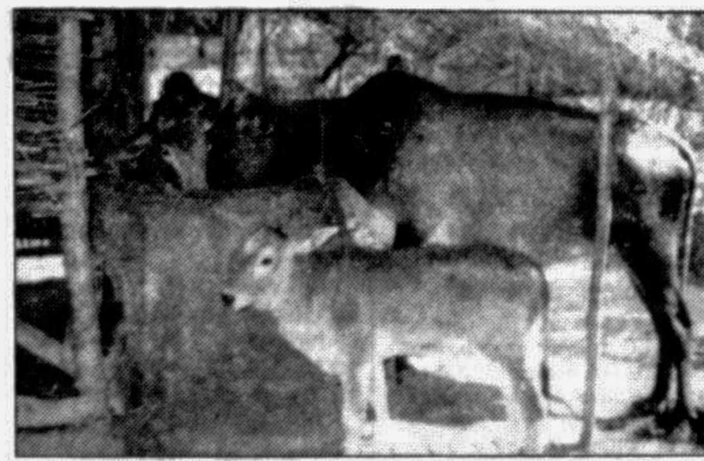
MAGURA: These cows were purchased by Shahdat Hossain of village Chandpur in Magura sadar thana with a credit support from Bittahin Samity of BRDB.