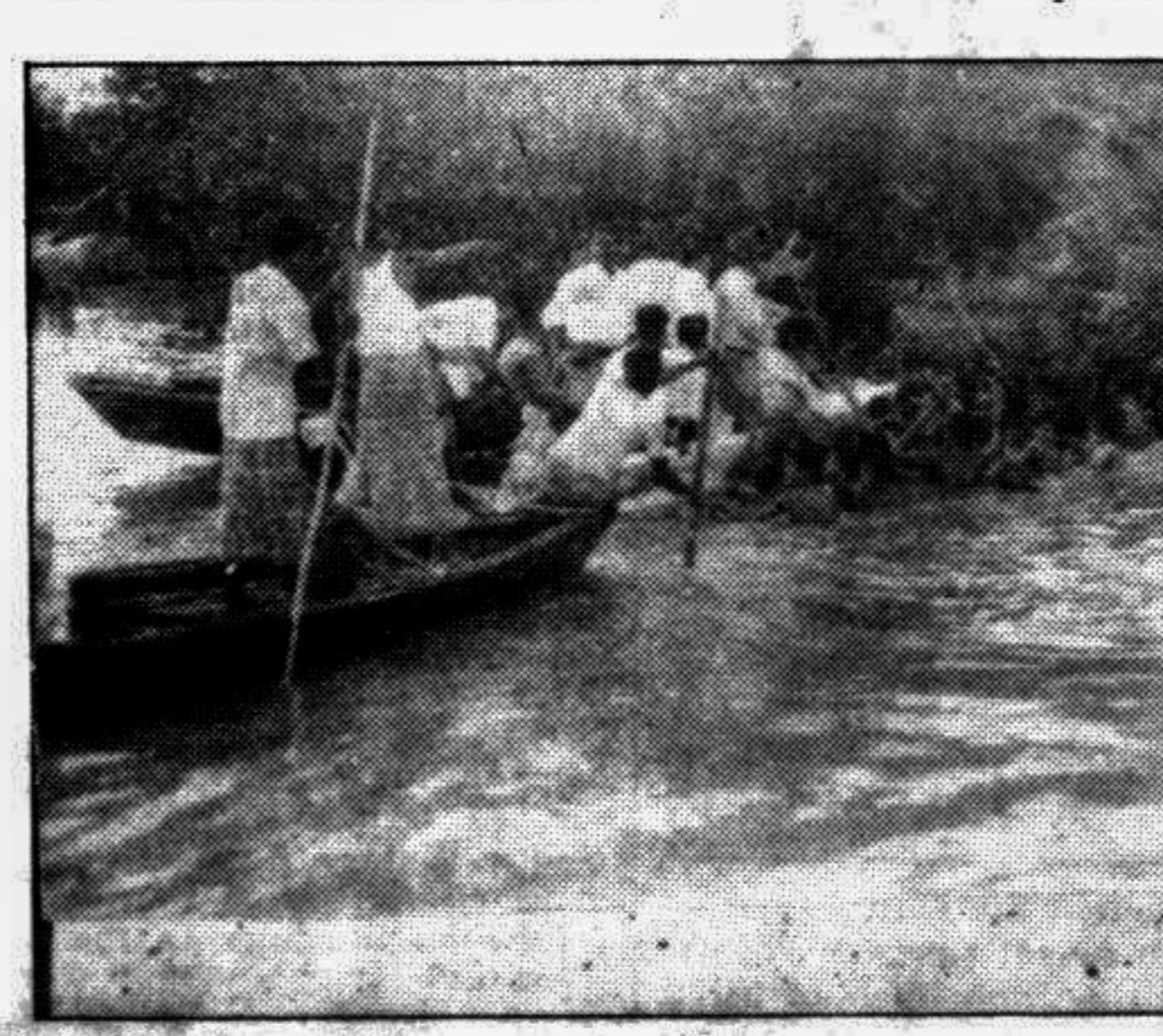
SHERPUR: The Deputy Minister for Health and Family Planning Sirajul Hoq distributing relief among the flood victims in sadar thana areas on Saturday. The Deputy Commissioner and the SP of Sherpur district were also present with the minister.